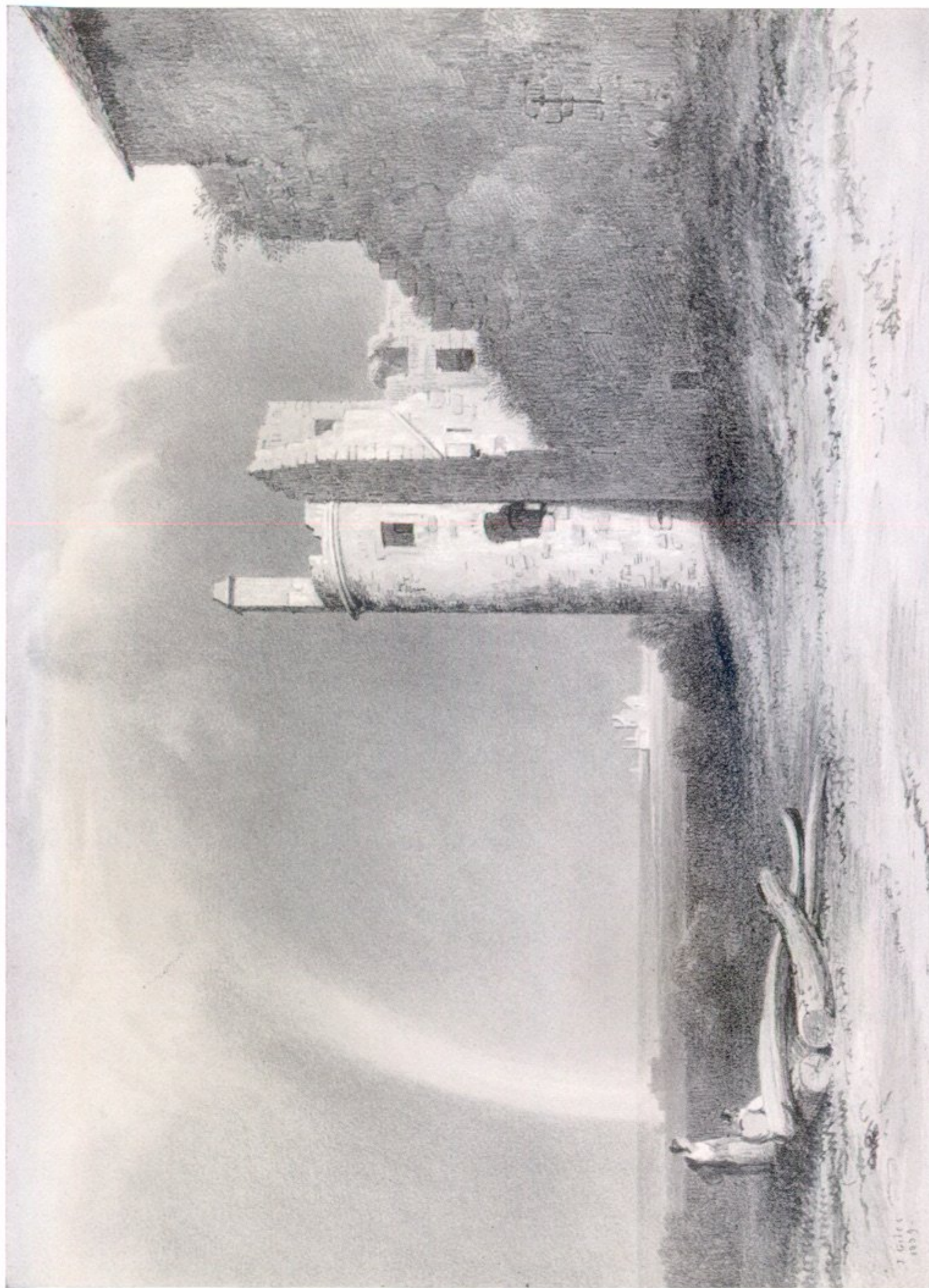
Pitsligo Castle by James Giles (1839).