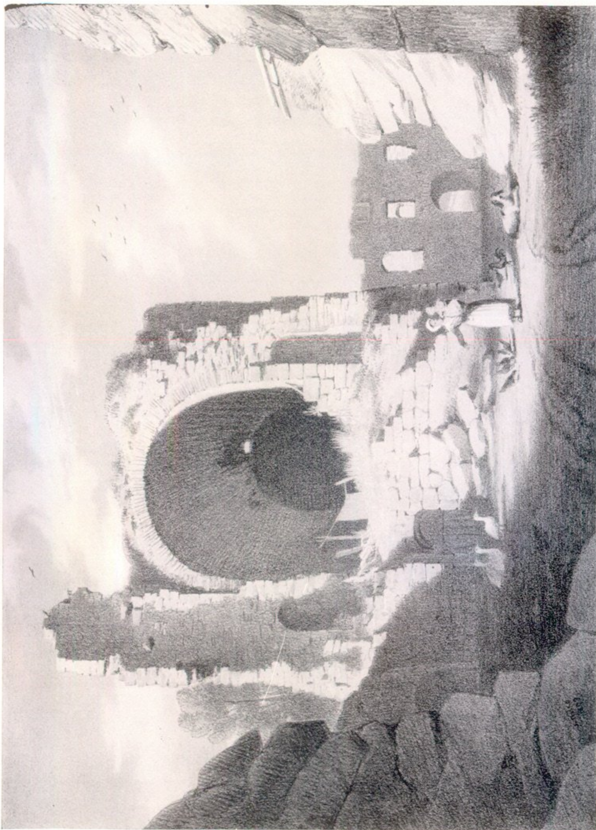
Pitsligo Castle, The Courtyard, by James Giles (1839).