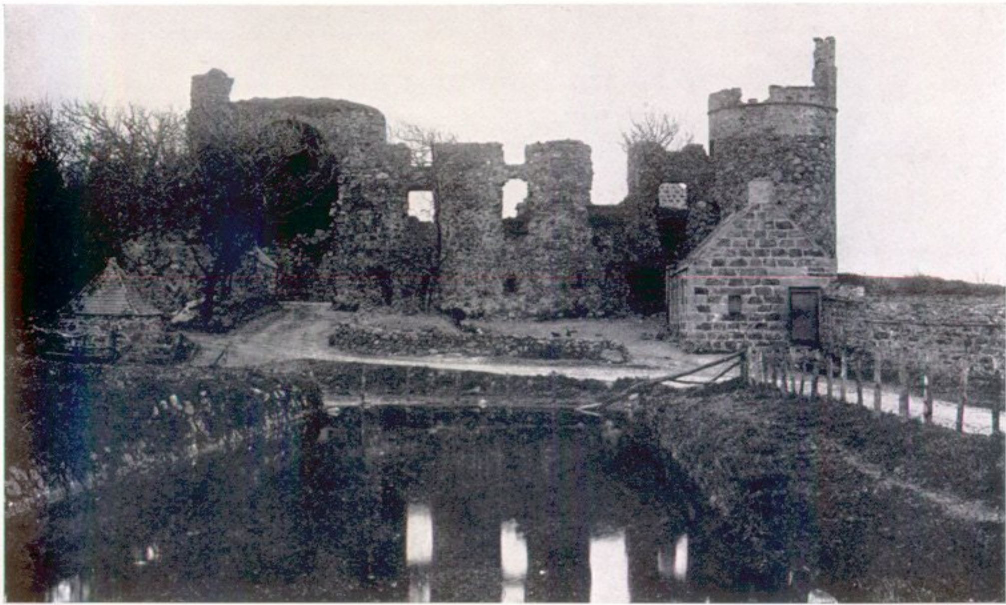
Pitsligo Castle: general view from east.