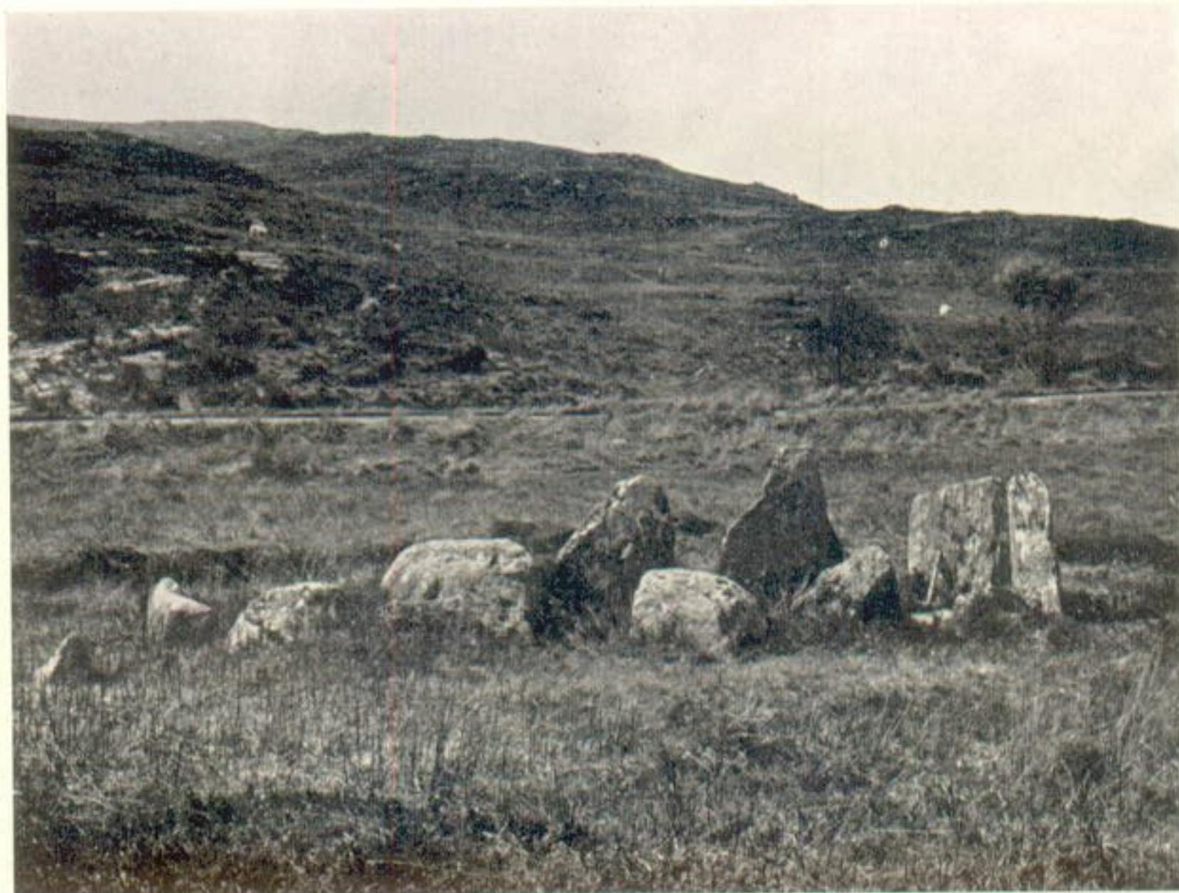
1. Badnabay corridor-tomb from NE. Headstone indicated by hammer. (Note 9.)