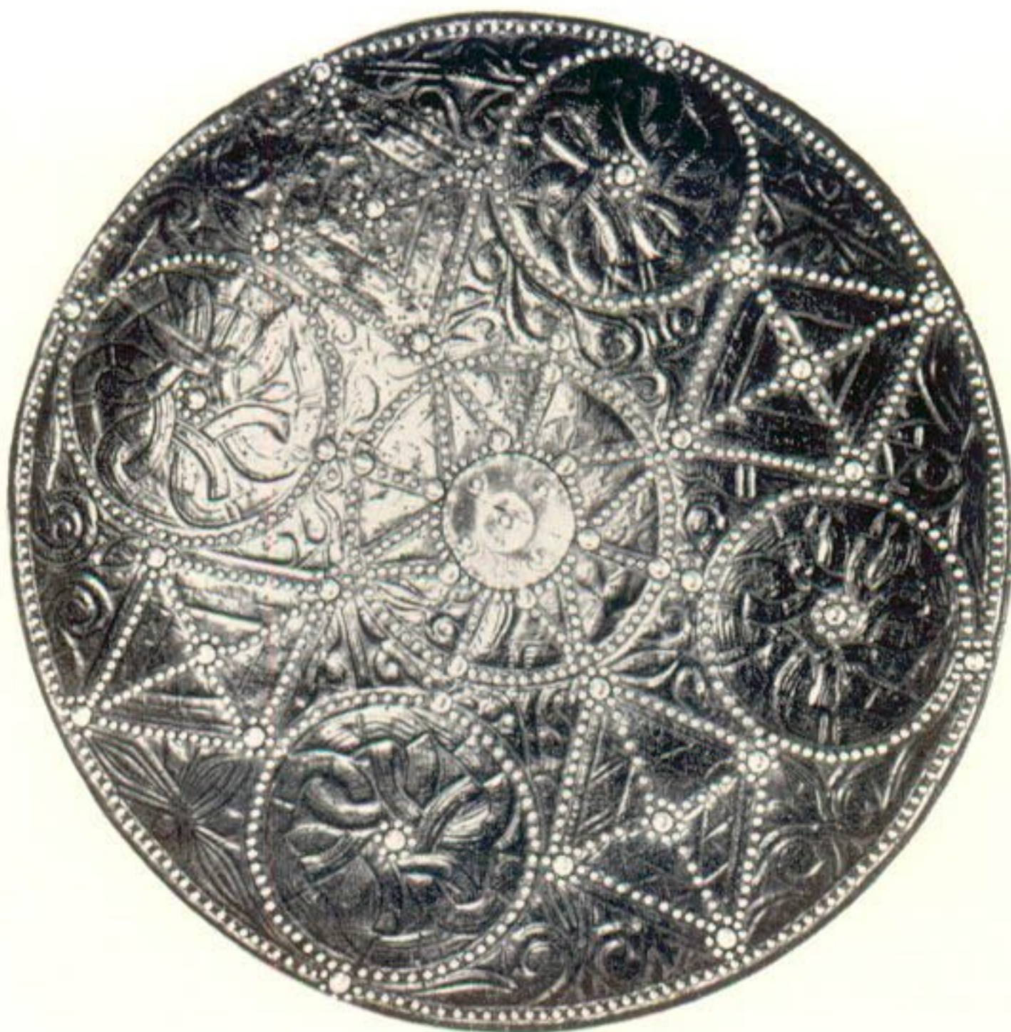
1. Tooled leather Targe with silver studs, believed carried by Marquis of Huntly at Sheriffmuir, 1715. (Note 4.) Actual diam. 21 ins.