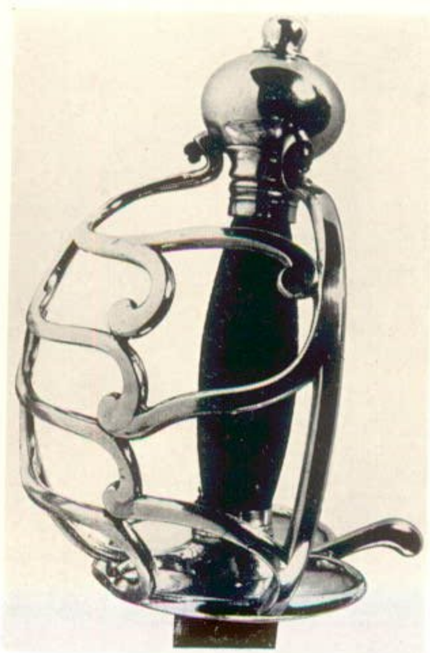
3. Silver-hilted broadsword from Milne-Davidson collection. (Note 4.) Actual length 6\frac{3}{4} ins.