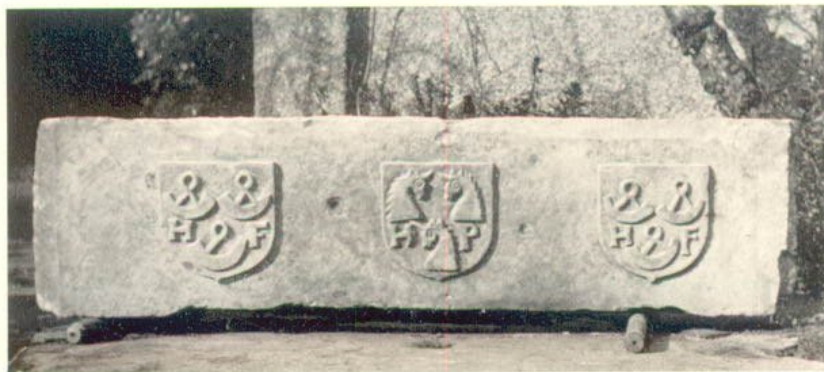
3. Corstorphine marriage lintel. (Note 10.) Length 5 ft. 3 ins.