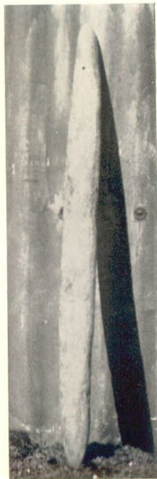
4. Stone implement from Urafirth, Northmavine, Shetland. (Note 8.) 3 ft. 2½ ins. long.