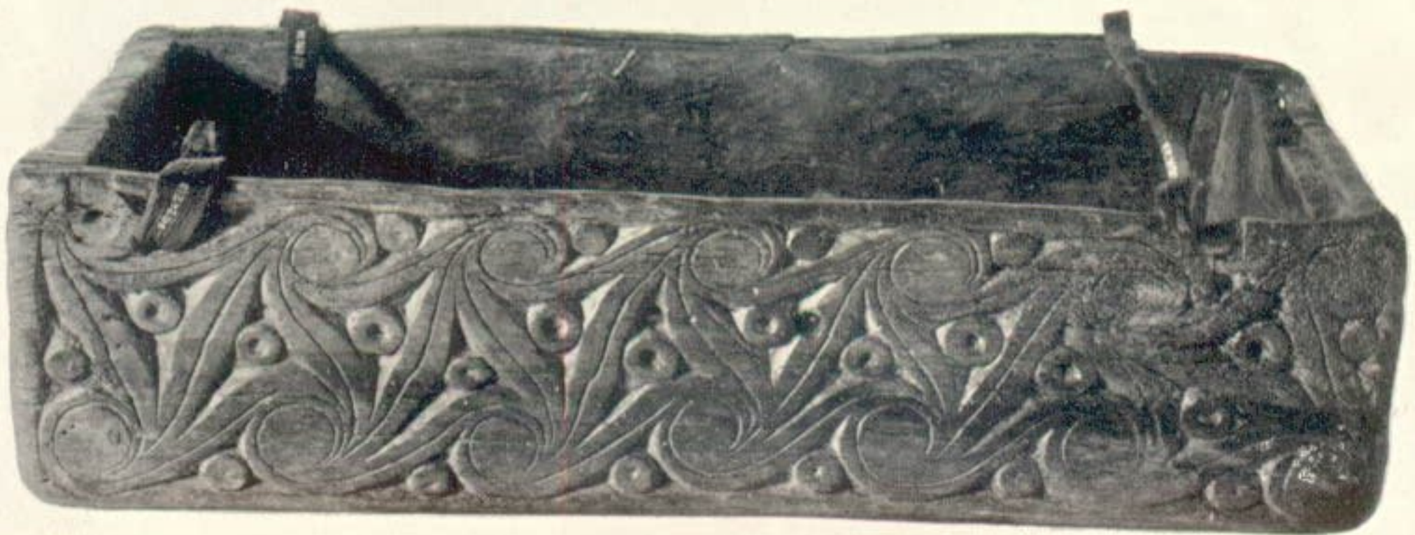
Wooden box from Birsay, Orkney, showing the three carved sides, and the remains of the fastenings for the sliding lid. (Note 1.)