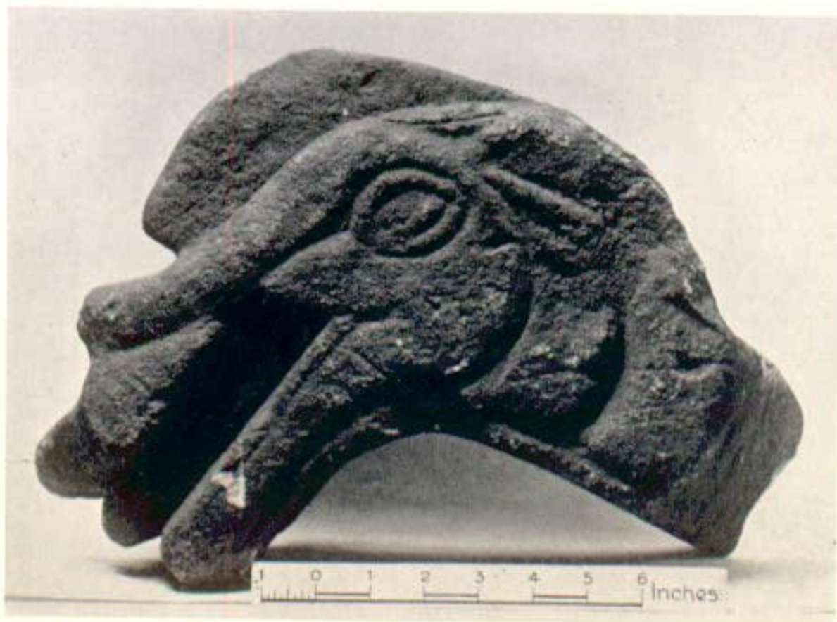
1. Dragon Head of sandstone, Kirkintilloch. (Note 6.)