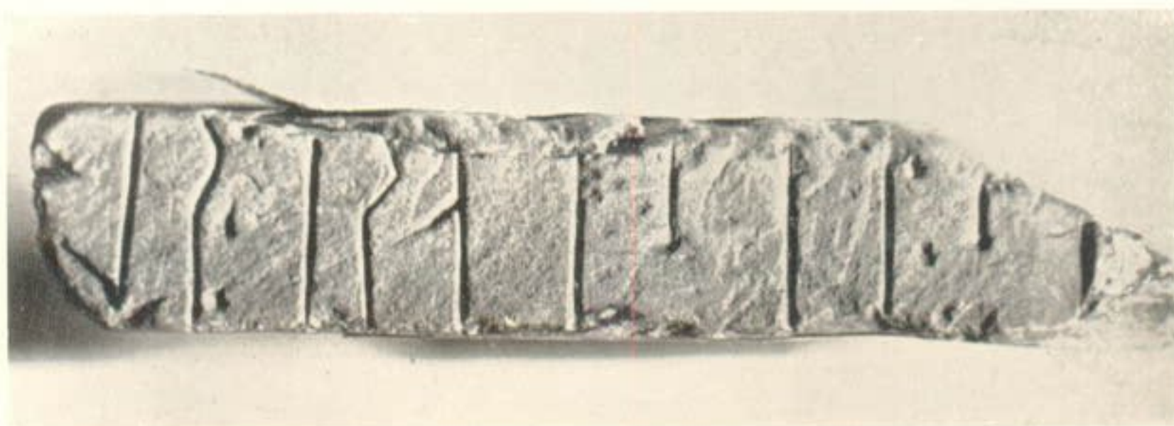
2. Runic stone, Papil, Burra Isle, Shetland. (Note 8.) Length 7½ ins.