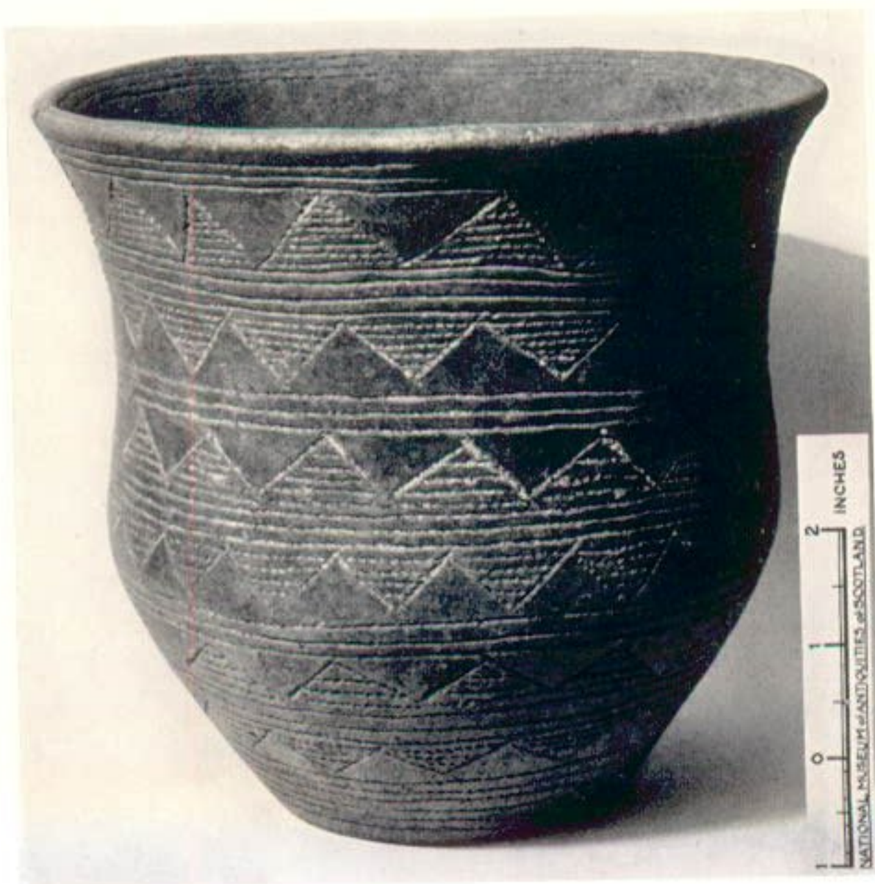
2. B 1 Beaker from Fingask, Perthshire. (Notanda.)