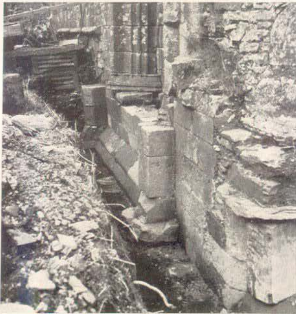
2. Whithorn: East end of south wall of nave, showing post-Reformation ground-level above medieval wall.