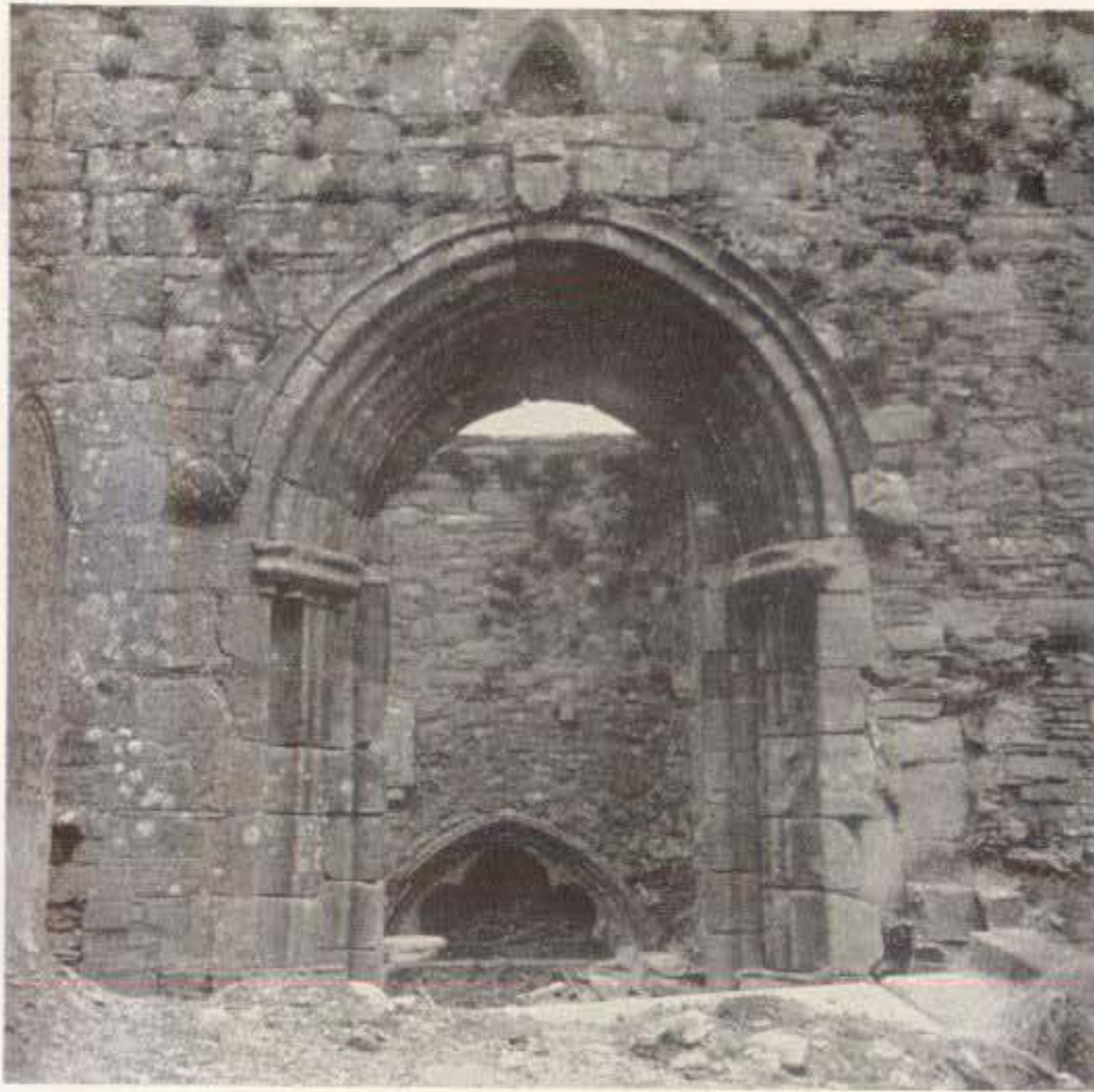
1. Whithorn: South door of nave, east end.