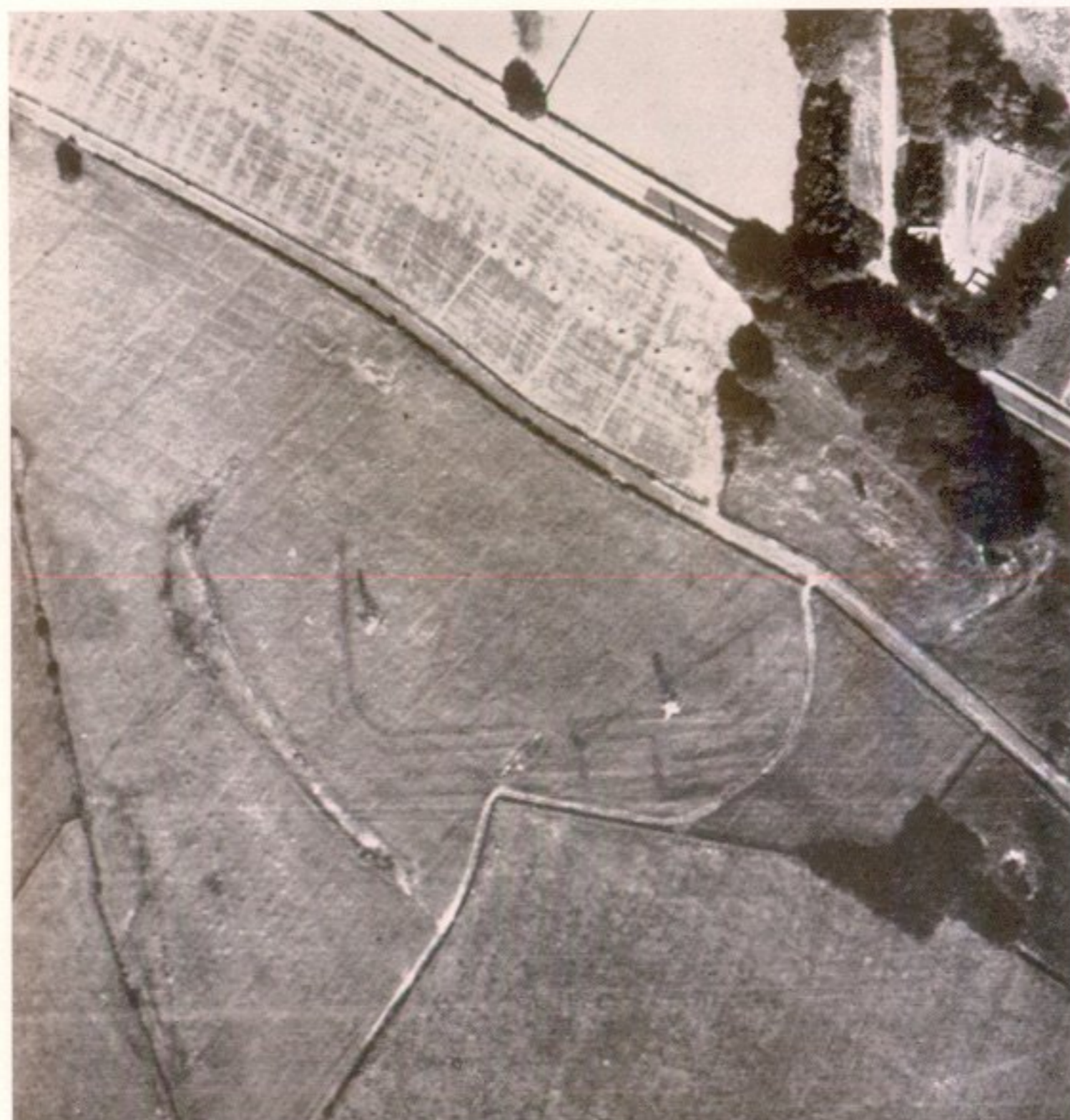
Air photograph of Roman fort at Whitemoss.