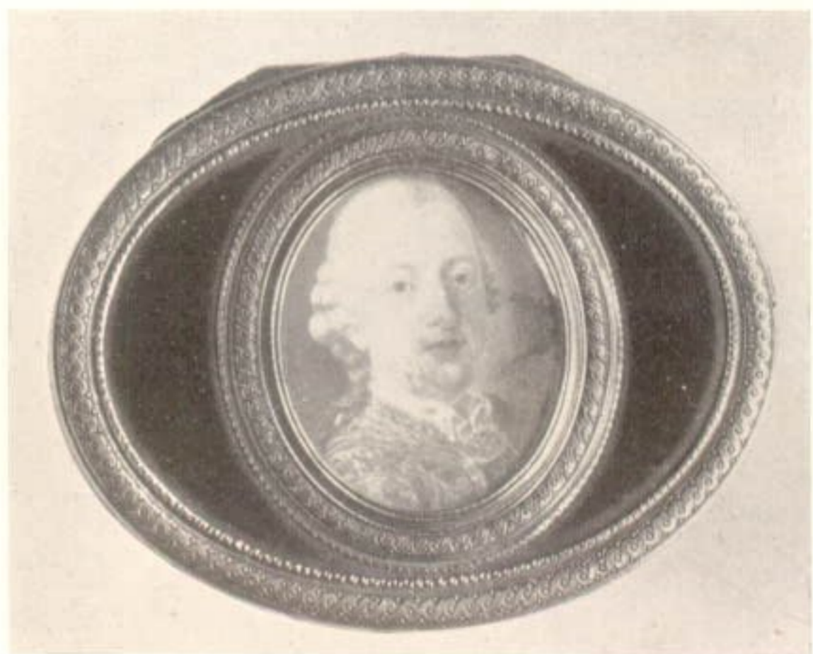
3. Gold-mounted tortoise-shell snuff-box with miniature of Prince Charles Edward Stuart ( \frac{1}{2} ).