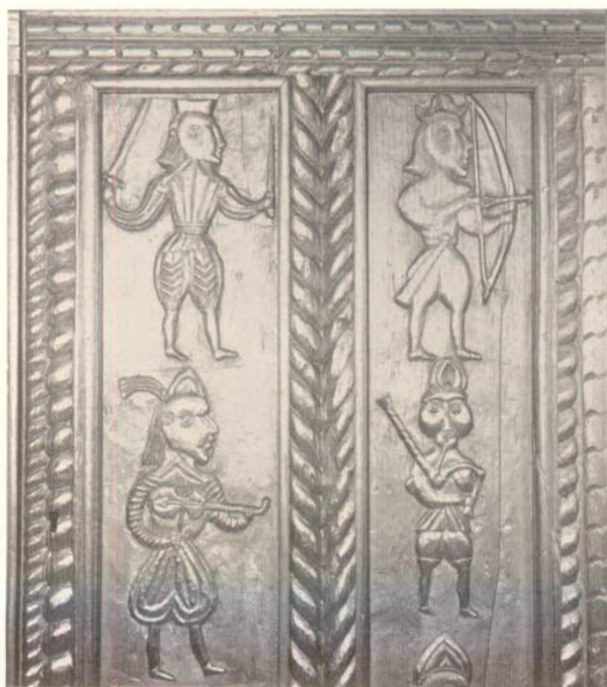
3. Greenlaw panels: detail of figures.