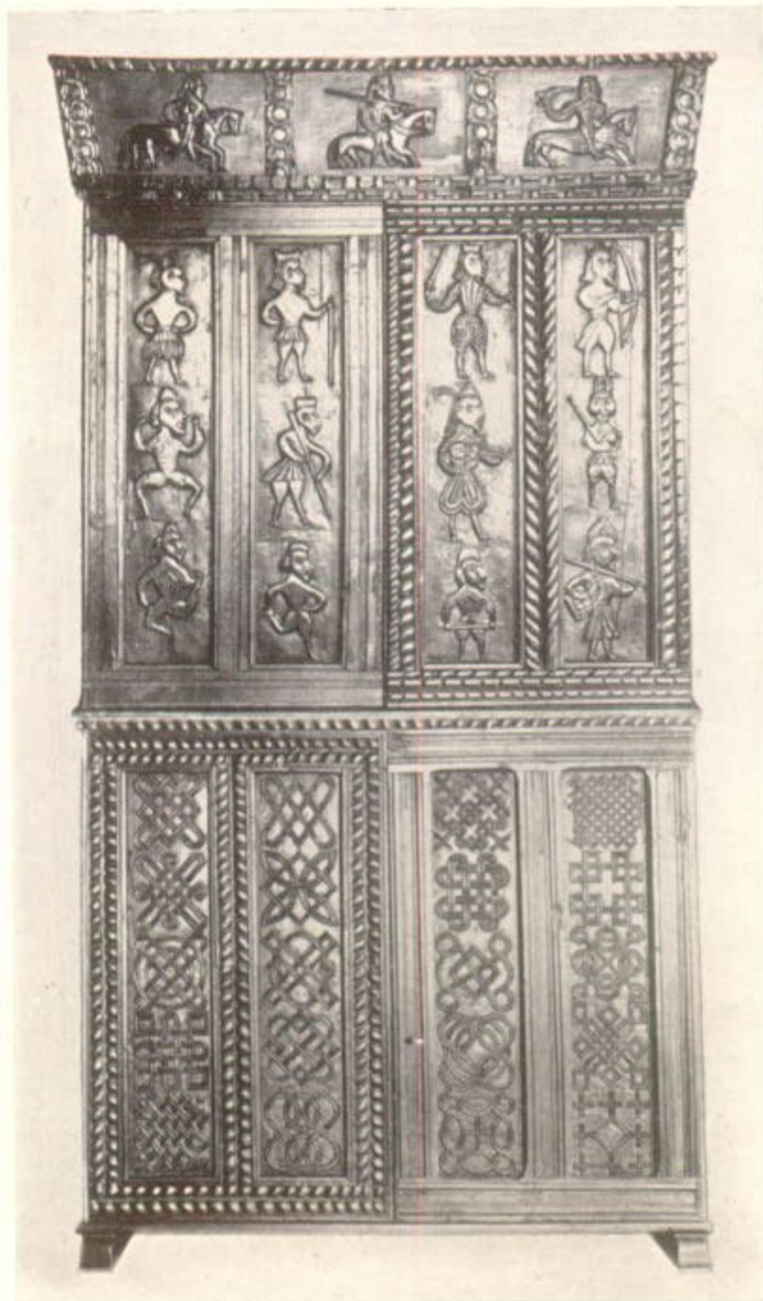
1. Carved oak panels, formerly at Greenlaw, Kirkeudbrightshire.