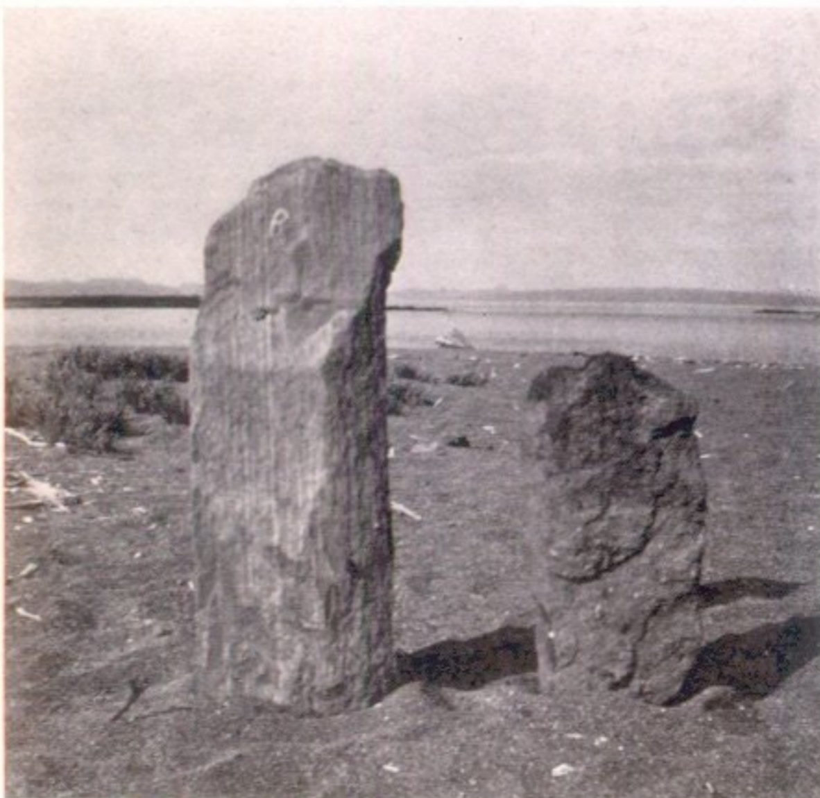
2. As they probably once faced the north bay.