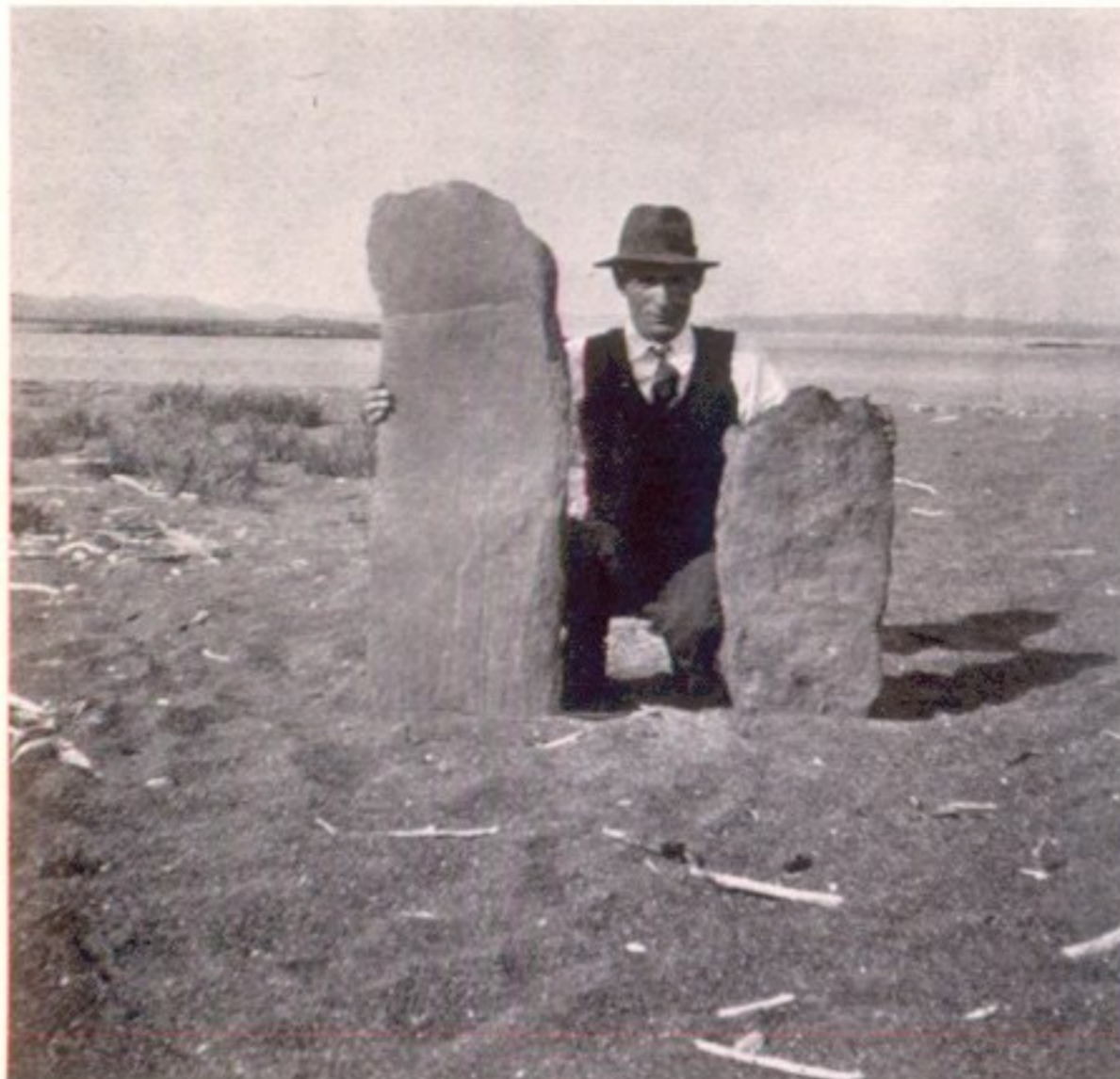
1. Memorial stones at Avalon, Newfoundland.