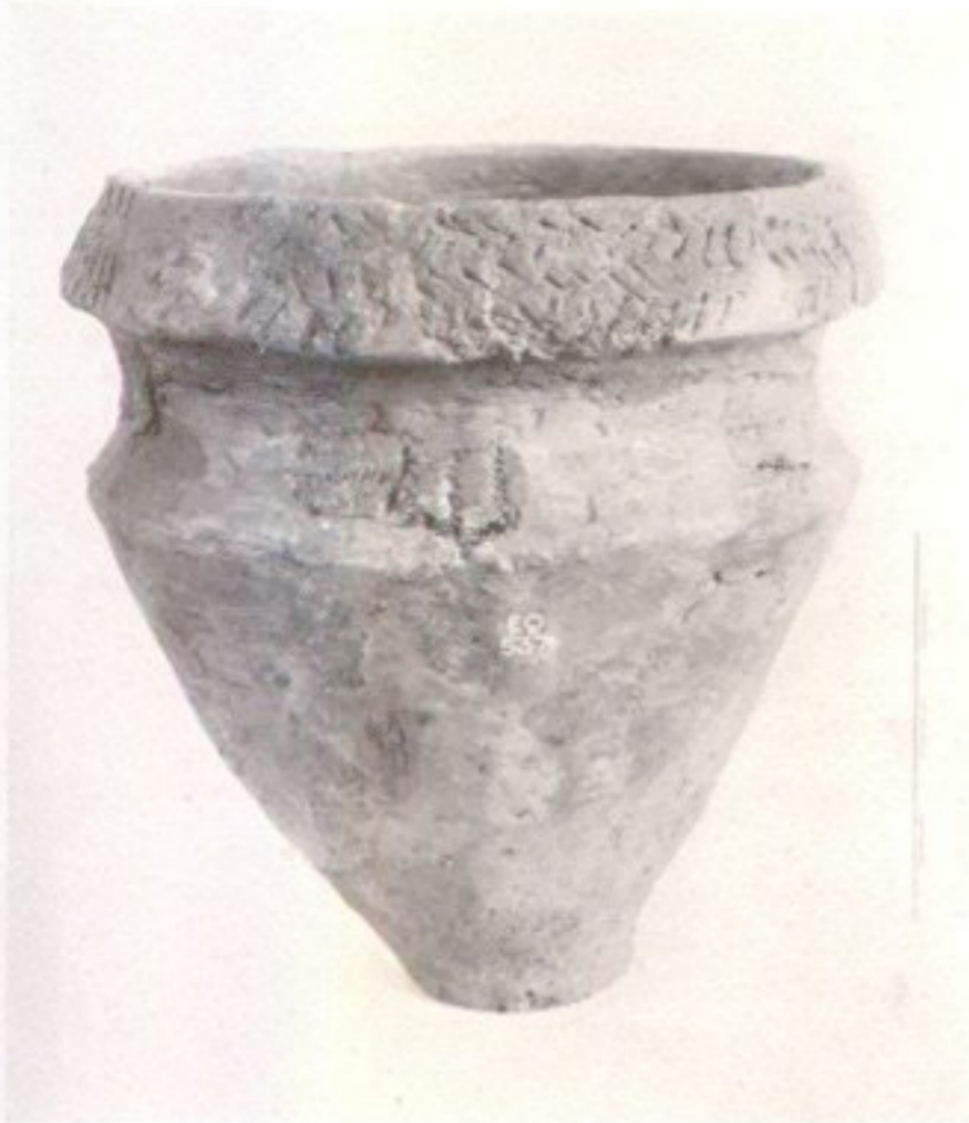
1. Urn from Falla Cairn, Roxburghshire. (c. \frac{1}{2} .)