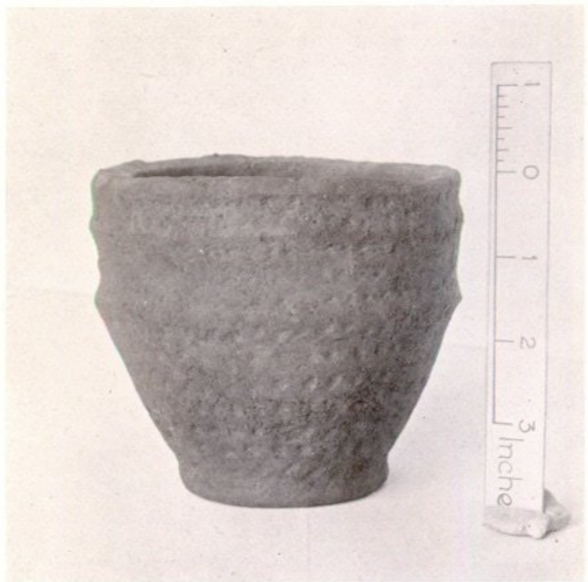
2. Food-vessel found at Abernethy, Perthshire. (Slightly less than half-size.)