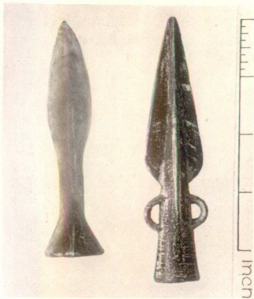
1. "Razor" and spearhead cast from the Campbeltown mould.