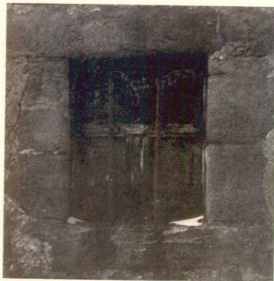
3. Window with panels, at South House, Liberton.