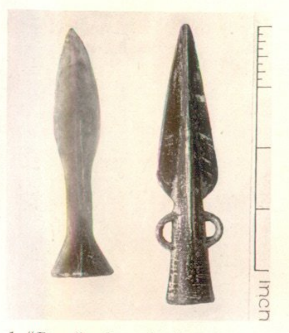
1. "Razor" and spearhead cast from the Campbeltown mould.