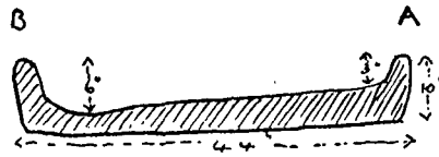
SECTION OF TROUGH FROM A - B