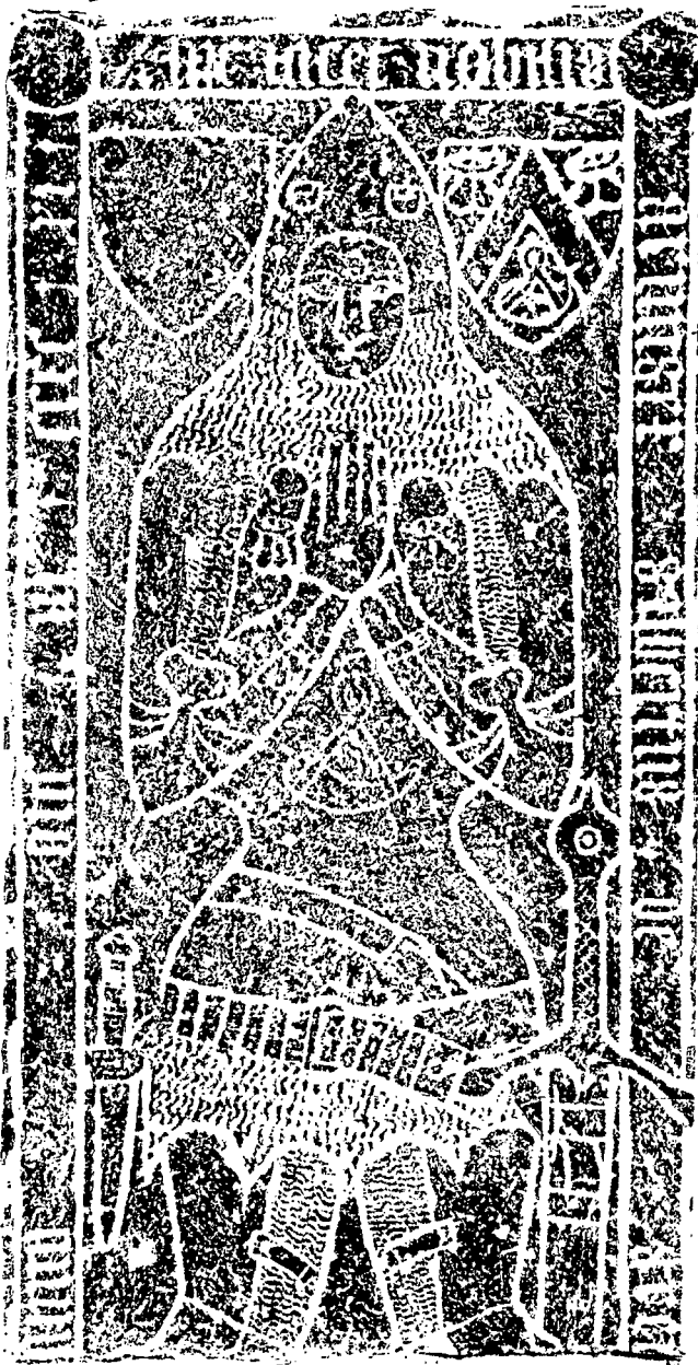
Fig. 1. Gilbert Grenlau, Esq. (1411) (obverse). Kinkell, Aberdeenshire.

6½ inches. It bears the boldly though somewhat crudely engraved effigy of an armed man, with a marginal inscription and two shields.