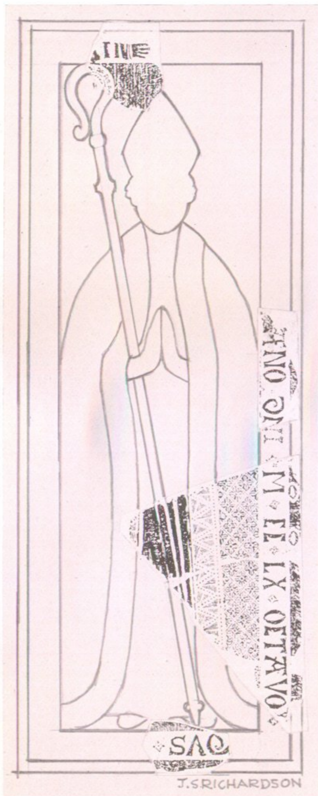
Shrine of St Nicholas, Cross Kirk, Peebles.

(Drawing showing relative positions and fragments of sculptured slab.)