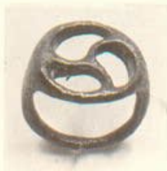
2. Bronze Finger Ring.