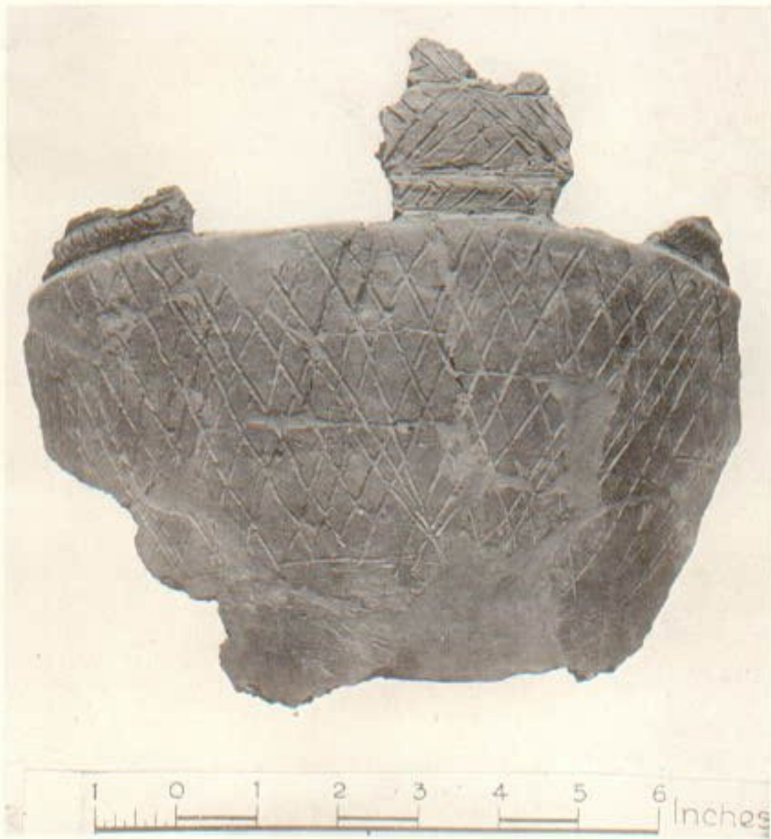
1. Cinerary Urn from Droughdool.