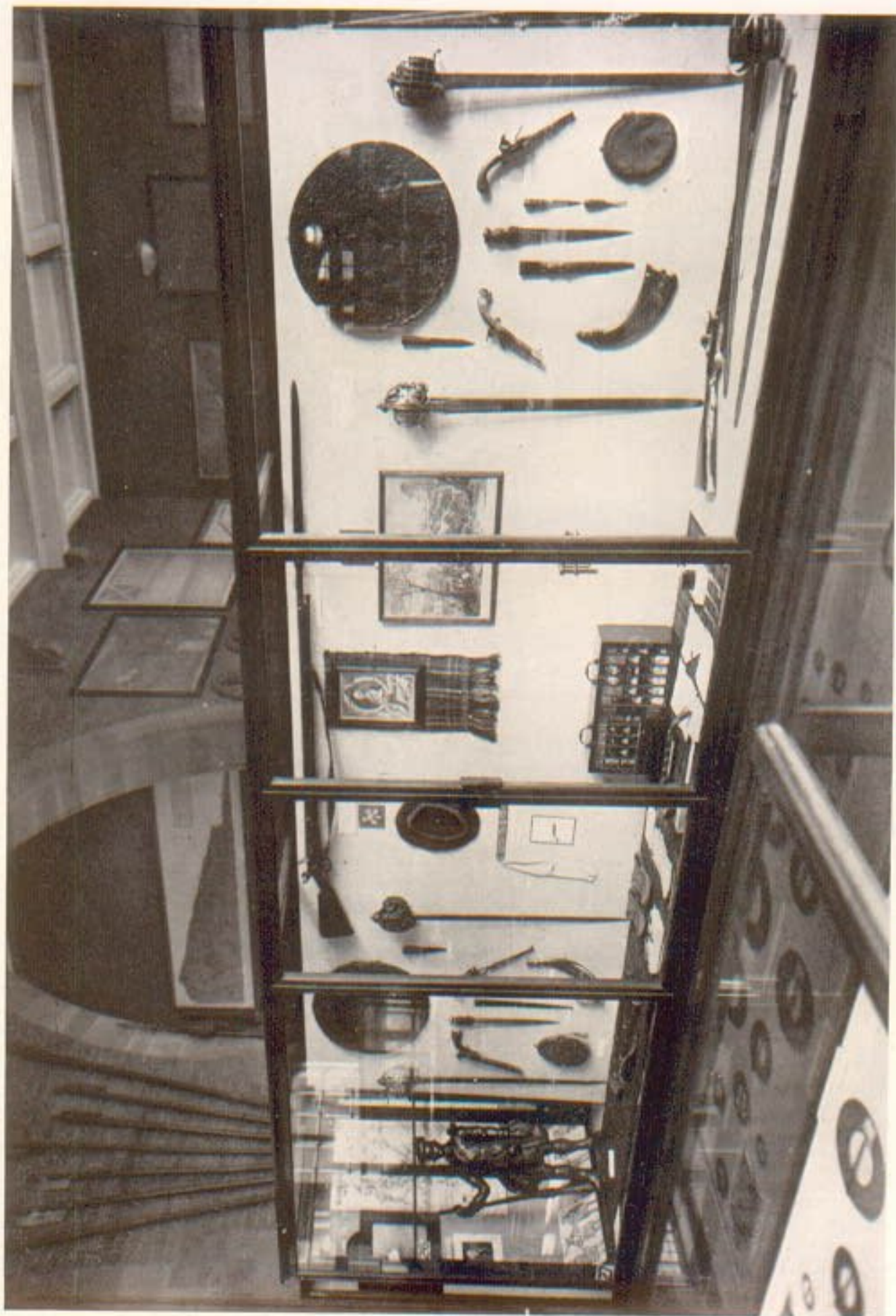
“From the Stone Age to the '45.” Case of Jacobite Relics.