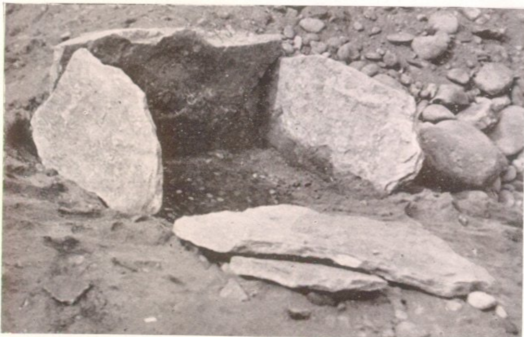
2. Cist II at Lunanhead.