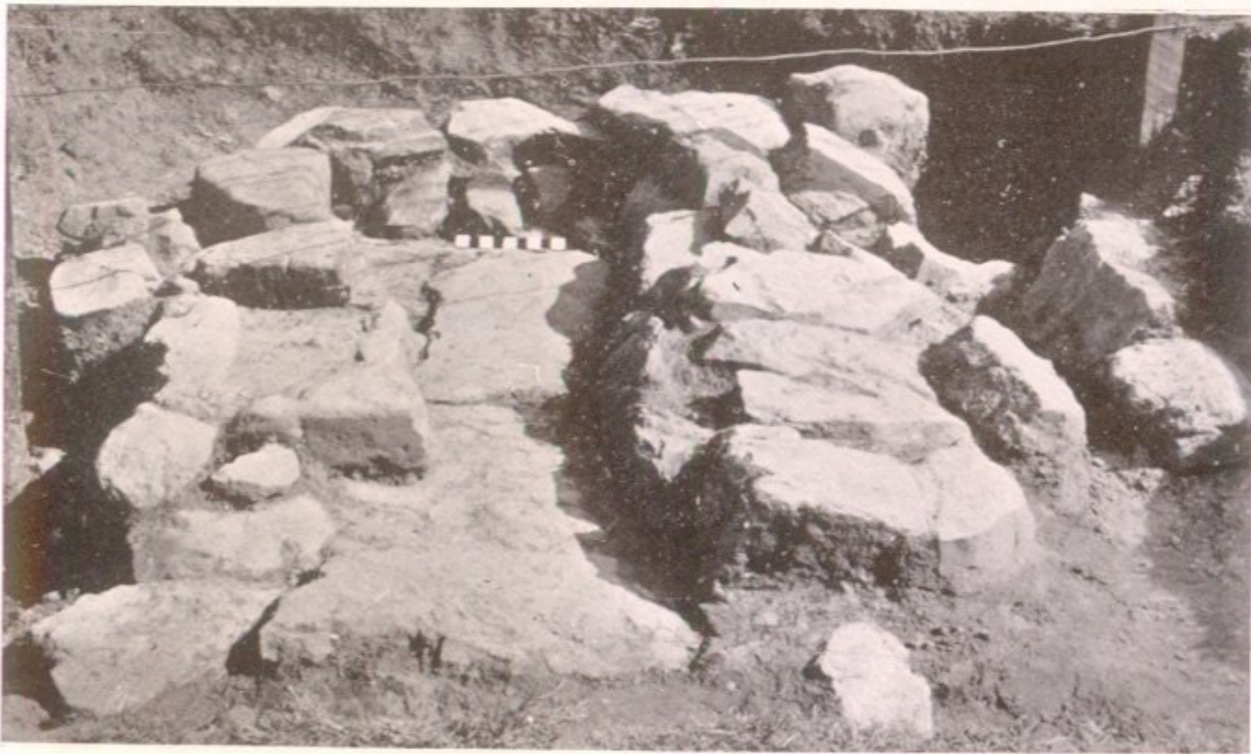
1. Roman Oven at Mumrills.