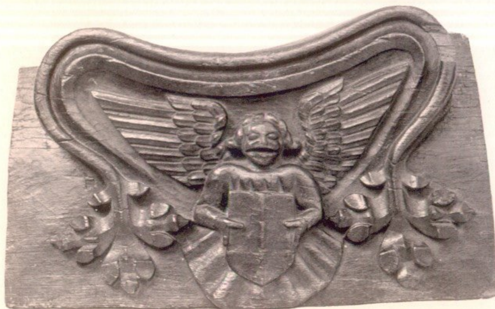
Misericord seats of oak from choir stalls, and said to be from the north-east of Scotland. Late fifteenth or early sixteenth century.