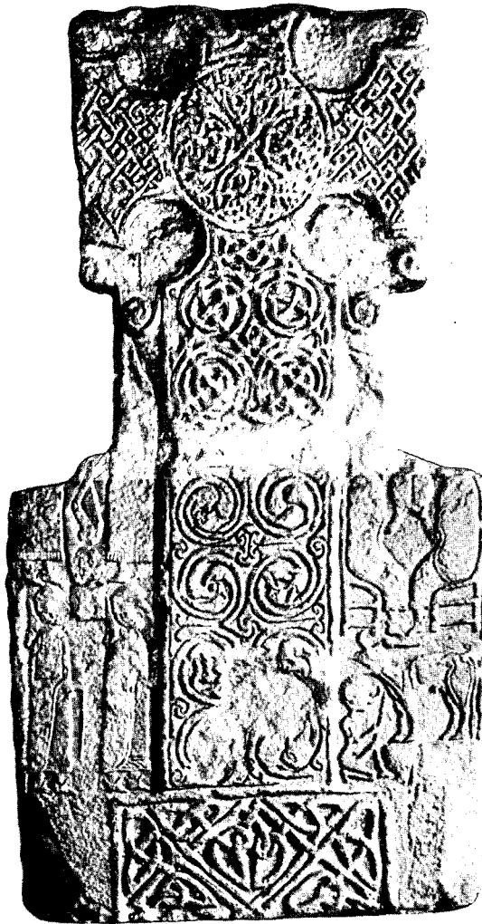
Fig. 2. In the church of St Vigean's, near Arbroath.

the face. Below, two priests with cowls pushed back, one with a book satchel on his shoulder, carrying staves or candles.