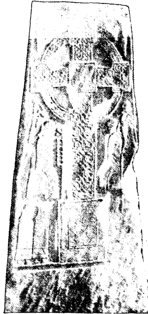
Fig. 1. Carved Stone at Fowlis Wester.

Fowlis Wester. —Some few miles on the road from Crieff to Perth a road striking uphill on the left leads to the hamlet of Fowlis Wester. The church was restored after the War as a memorial to those fallen, and in so doing a long stone was removed from a wall (fig. 1). It was then seen to be carved, though the stone had flaked off before the carving was finished. A cross of plaitwork occupies the centre, to the left, a man seated in a carved chair ending in a hound's head at the back, has a plant with seven leaves and a double bud in front of him. He is faced on the far side of the cross by an ecclesiastic in robes and cowl whose chair ends in a bishop's crook, and above whose