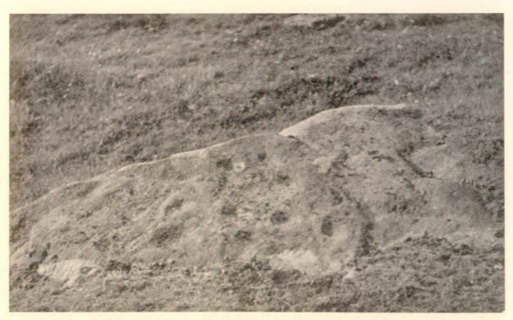
Fig. 2. Cup-marked Stone at Claonaig, Kintyre.