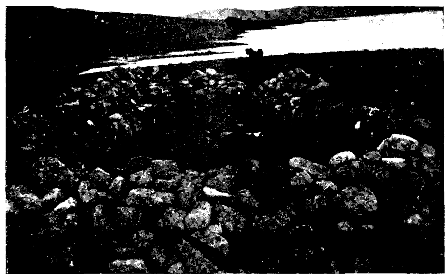
Fig. 2. Oblong Structure, Donald's Isle, Loch Doon.

There is only one entrance, 3 feet wide, through the west wall, which is 4 feet in thickness. This entrance is not in the centre, but 22 feet from the north and 28 feet from the south end of the wall. The rear