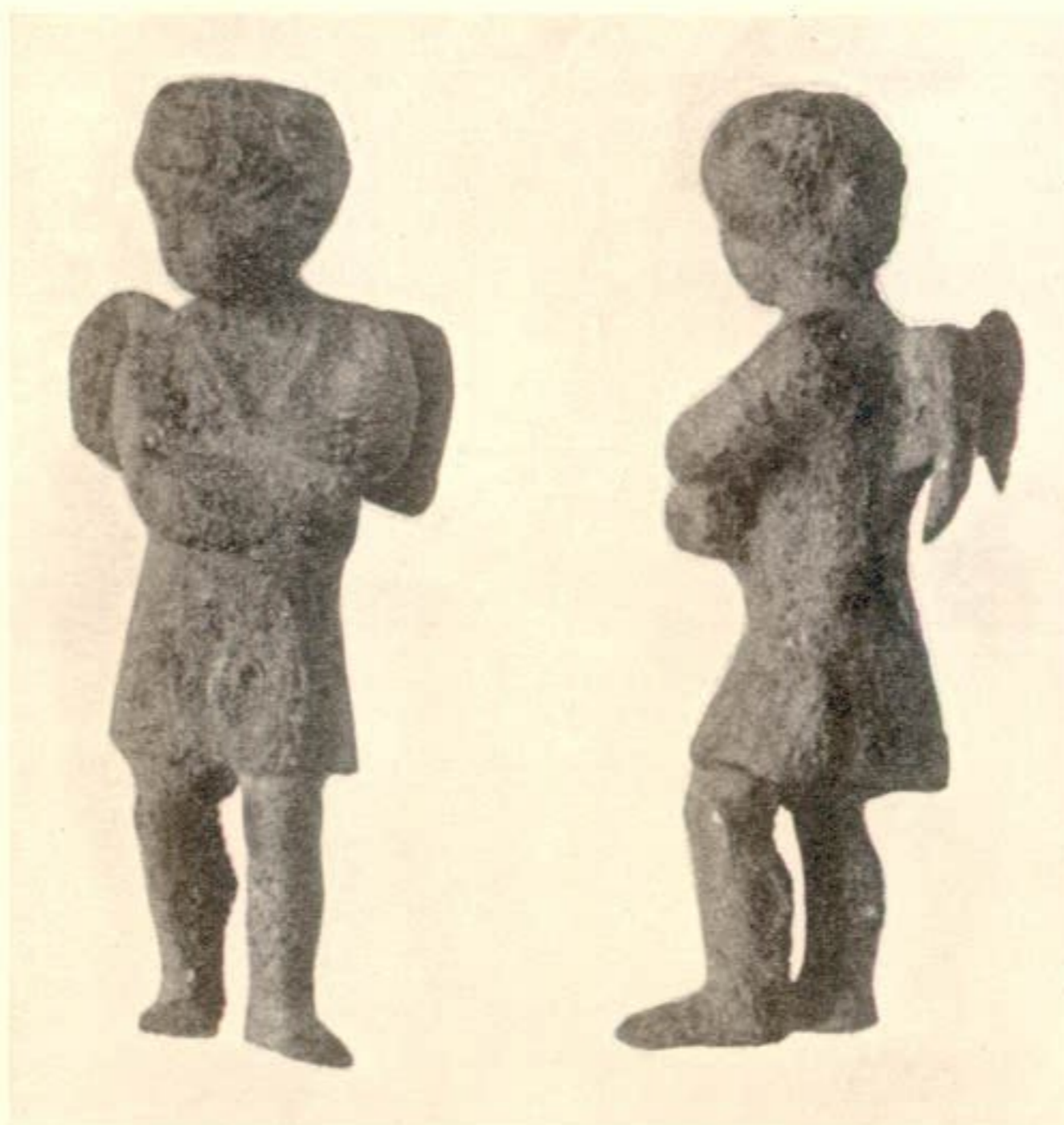
Fig. 3. Bronze Figurine of Eros found in Edinburgh. (†.)