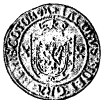
Fig. 1. Écu or Abbey Crown of James V.

It is an unusual event nowadays to be able to bring to notice an unpublished Scottish coin. The coin in question is an écu or abbey crown of James V. which came into my cabinet from a London sale this year. It was identified in the Sale Catalogue with Burns, Fig. 742, No. 4 a , but the reproduction of the obverse given in the plate made it immediately clear that it was unlike any of the écus already noticed by numismatists; it was unknown to Burns. The crown was small; the points between the legend were neater than those on any published of this reign; similarity to the first issued gold of the reign of Mary was at once noticeable.