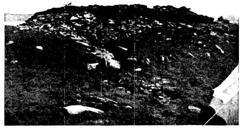
Fig. 2. Burgi: Approach.

Immediately in front of the "Burgi," a rampart, with corresponding ditch on either side, is carried across the narrow junction of the headland. The rampart is formed of earth and stones, and appears to have been revetted on the inner side with a roughly built wall about 3 feet high, banked with a compacted mass of clay intermingled with stones.