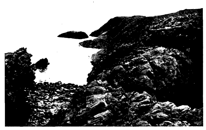
Fig. 1. Burgi: Natural arch.

The Ness of Burgi is a small headland situated at the southern end of the main island of Shetland, across the voe to the west of Jarlshof and Sumburgh Head. It is formed of sandstone, the beds tilted at an