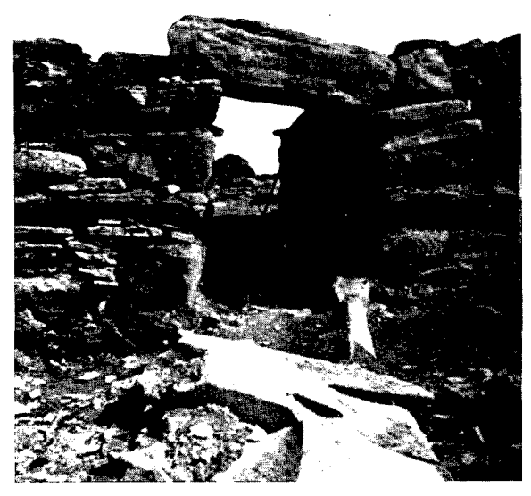
Fig. 3. Burgi: Doorway.

5 feet, but decreases in width to 4 feet for the remaining 16 feet, leads through the building, near its centre, into a sort of natural courtyard, about 20 yards square, formed by the cliffs which surround a level stretch of turf. Outside the entrance three slabs of stone resembled drain covers. They were, however, more probably paving-stones, or even lintels fallen from above. Some 5 feet from the entrance there had been a door, evidenced by a doorstep, formed by a narrow upright slab, still in situ, on one side, and by two bar-holes, passing through the