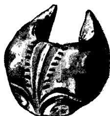
Fig. 3. Bronze Mount. (†).

Leaf-shaped Arrow-head of reddish Chalcedony, imperfect, measuring \frac{7}{8} inch by \frac{3}{4} inch: lop-sided Arrow-head, imperfect, measuring 1\frac{3}{16} inch by \frac{11}{16} inch; two scrapers, measuring \frac{3}{4} inch by \frac{9}{16} inch and 1\frac{5}{8} inch by 1\frac{5}{16} inch; Knife, flat on one side, and dressed on both edges, measuring 2 inches by \frac{3}{4} inch; two triangular Tranchets, measuring 1\frac{5}{8} inch by 1\frac{11}{16} inch, and 1\frac{1}{4} inch by 1\frac{11}{16} inch, the second imperfect; and four worked objects, all of grey and brownish Flint; a hollow Bronze Mount, the lower part tubular with two rivet holes in the back; the upper part spheroidal in front with two wing-like projections behind, is decorated on the face with two oval pellets, with curved lines springing from a central stem between them (fig. 3). All found by the Donor on Airhouse, Oxton, Berwickshire.