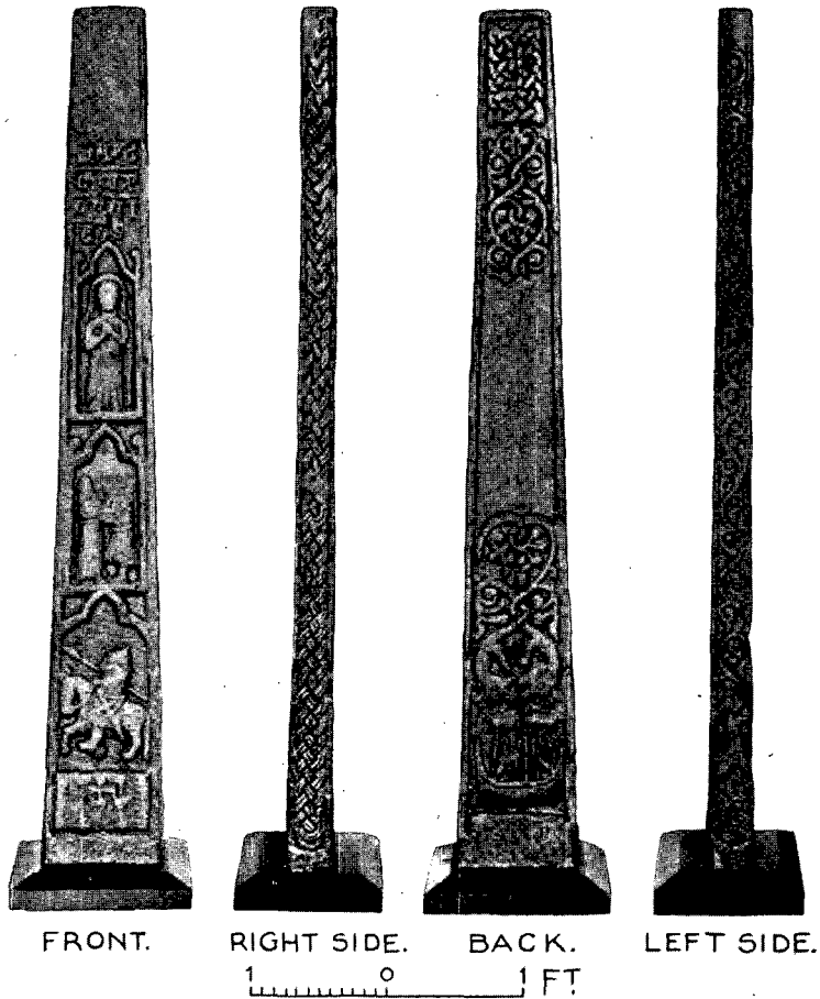
Fig. 4. Cristin's Cross, Kilkerran, Argyll.

MA'T (or D)/ ET VX/OREI/ VS, but the upper five lines have since scaled off. From Kilkerran, Campbeltown, Argyll.