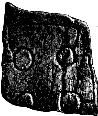
Fig. 3. Cross-slab at Glenluce Abbey.

The formation of the cross is curious and interesting. Judging by the details, the rustic sculptor was well acquainted with both the Whithorn type with its rings, and the Northumbrian free-armed head. In combining the two he has produced on his slab a hammer-headed cross.