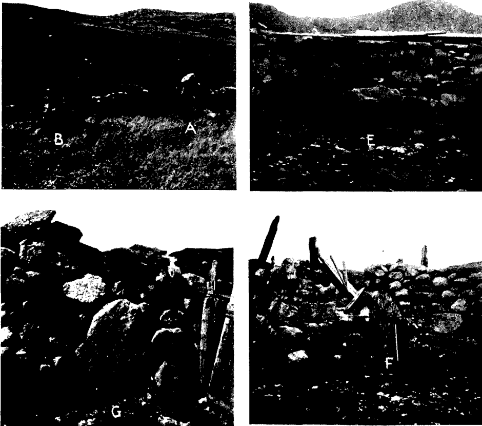
Fig. 2. Stones in Circle at Loch Seaforth.

The present house on M'Lellan's croft, which is not shown on the