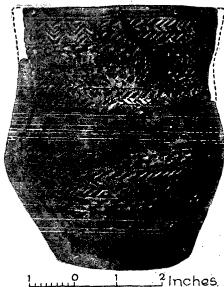
Fig. 4. Beaker from Skene, Aberdeenshire.

the lower band survives, but it seems to have consisted of a lozenge pattern. The label attached states: "Urn from a cist found in a sand-hill at Newhills, Parish of Skene."