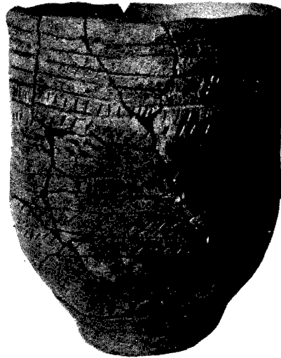
Fig. 2. Beaker from Strathnaver, Sutherland.

Beaker of reddish-brown Clay, containing some crushed stone, measuring 7\frac{1}{2} inches in height, 6\frac{1}{8} inches in diameter at the mouth and at its widest part, and 3\frac{3}{8} inches across the base (fig. 2). The wall is \frac{5}{16} inch thick, the top of the rim being rounded. The urn is of unusual shape, the bulge being at about one-third of its height, and the part between it and the rim almost vertical. The decoration on the exterior is crude and has been incised with a pointed tool. It is arranged in three irregular zones, at the top, at the widest part, and just above the base. The highest consists of five and six transverse lines, with short oblique lines between them in places, below which are rows of oblique lines, one to the left and two to the right. The central zone consists of six transverse lines with short strokes slanting from right to left between the third and fourth, and fourth and fifth lines. The bottom band consists of four transverse lines. Found by the donor about twenty-two years ago, in a short cist in a gravel pit on the roadside at Woody Knowe, Strathnaver, about eleven or twelve miles from Bettyhill.