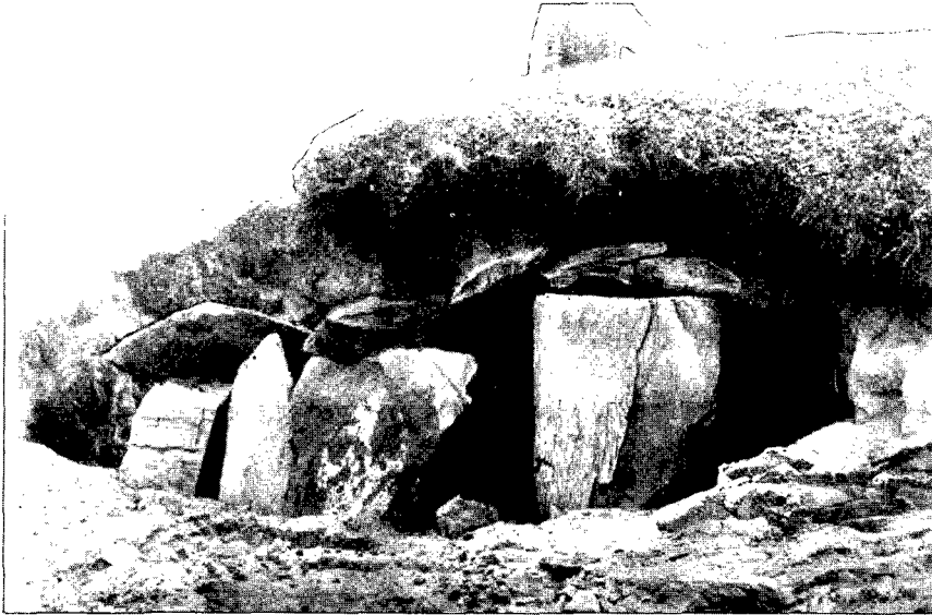
Fig. 1. Viking Cist-grave at Ballinaby, Islay.

The relics consisted of an axe which was found on the left side of