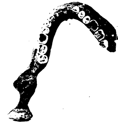
Fig. 4. Mandible from Rungally Cist, with carious cavity on first left molar, and worn crown of the first right molar tooth.

Vertebral Column: Atlas. —Transverse processes were absent. Lateral masses and arches were massive, and the space which they enclosed narrowed transversely. The articular pillars were deep, and the superior articular surfaces