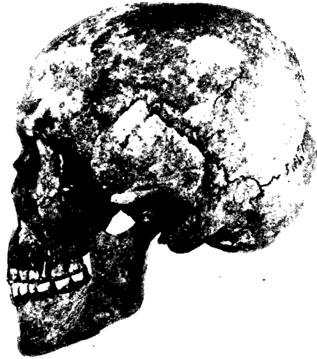
Fig. 2. Rungally Cist Cranium with Mandible. Norma lateralis.

Norma occipitalis (fig. 3).—This aspect of the skull is distinctive.