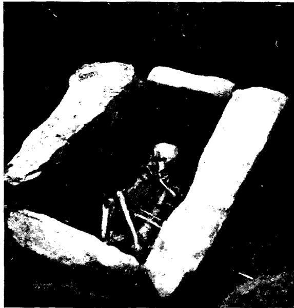
Fig. 1. Cist at Rungally, Fife.

The loose earth and fine gravel which filled the cist were carefully removed and put through a riddle.