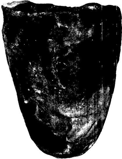
Fig. 1. Cinerary Urn from Blows, Orkney.

seen from the accompanying illustration) to effect a complete and admirable reconstruction.