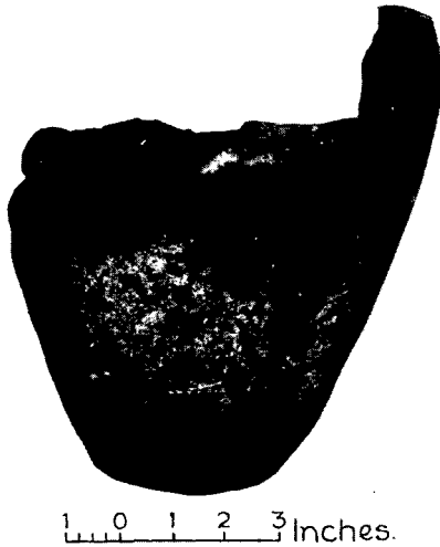
Fig. 7. Cinerary Urn from Nisetter, Shetland.

the upper portion. I have already drawn attention to this way of making certain vessels. 1 In fig. 8 are shown three methods of building