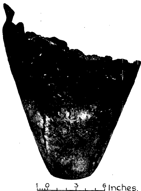
Fig. 2. Cinerary Urn from Culla Voe, Shetland.

A small cemetery of cinerary urns containing cremated human remains was discovered in a small hillock near the head of Culla Voe, Papa Stour, Shetland. 1 Three large urns of dark-coloured ware simply buried in the mound, standing on their bases, and covered by a flat stone were first unearthed. Two were destroyed, but the third (fig. 2) was acquired by the Museum. The presence of the last urn was suggested by a small circle