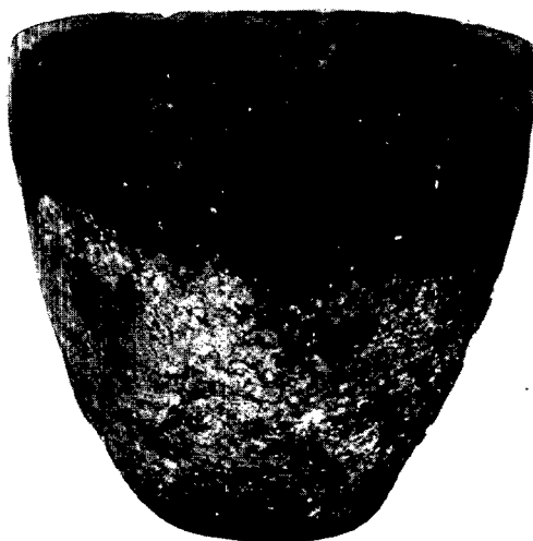
Fig. 5. Cinerary Urn from Flemington, Shetland.