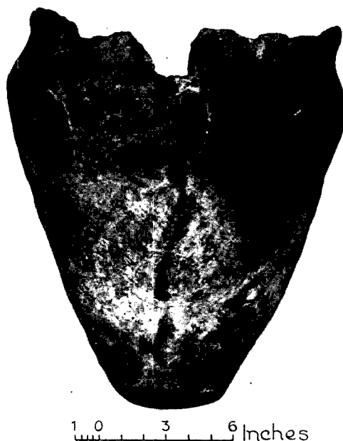
Fig. 3. Cinerary Urn from Culla Voe, Shetland.