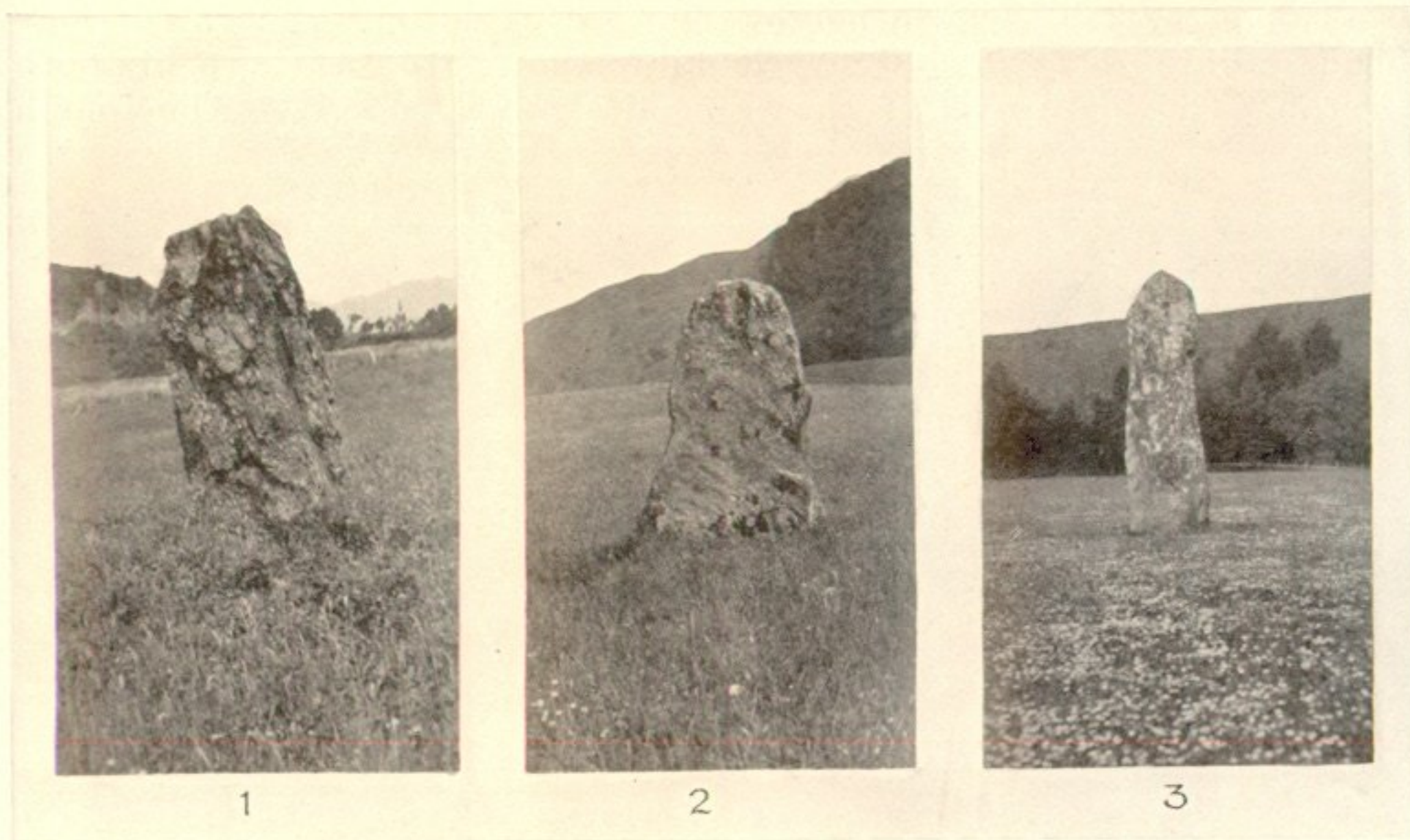
Fig. 2. Standing Stones : No. 1 at New Selma ; No. 2 near Benderloch Station ; No. 3 at Acharra House.