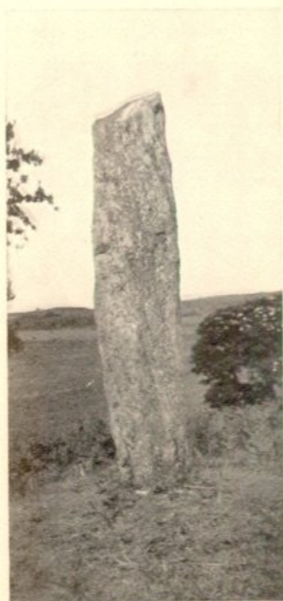
Fig. 3. Standing Stone near Dalintober.