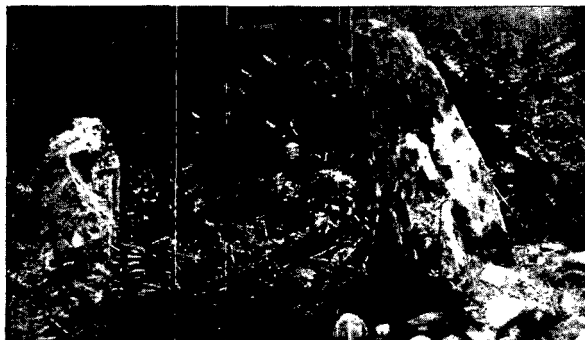
Fig. 5. Ruined Megalithic Cist near Dalintober.

Along the northern shore of Loch Etive there are three circular cairns