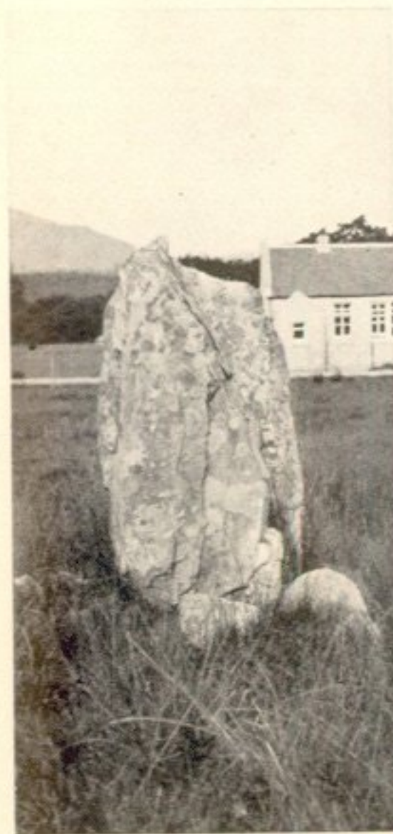
Fig. 4. Standing Stone, Barcaldine Schoolhouse.