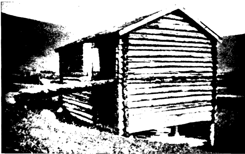
Fig. 3. Skottelaaven—the Scots Barn.

The peasants were naturally overjoyed with their success and spent the night in feasting and drinking. In the morning came the necessity of determining what was to be done with the prisoners. If they had been fewer in number the problem would not have been so troublesome. But Oslo was 200 miles away, and August was the busy month when men could not be spared to guard so large a band of prisoners; and provisions for so many would be difficult to procure. The peasants were still excited; and recently the rumour had reached them of the marauding of