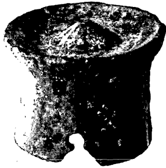
Fig. 2. Bronze Capsule or Shaft-butt from Traprain Law. (†)

1\frac{11}{16} inch in diameter (fig. 2). The end is cupped with a conical projection in the centre. The socket is imperfect, but shows the remains of a rivet hole on one side.