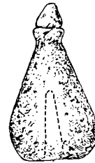
Fig. 3. Playing-man of Cetacean Bone from Sandwich Bay, Shetland. (†)

Token Mould of Lead, of Horndean Associate Congregation, 1807.