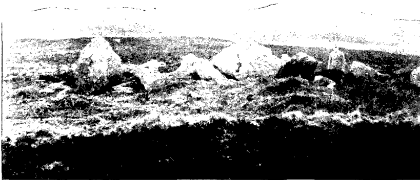
Fig. 2. Auchnaha : the Façade.

The façade constitutes an additional link with Arran cairns, like