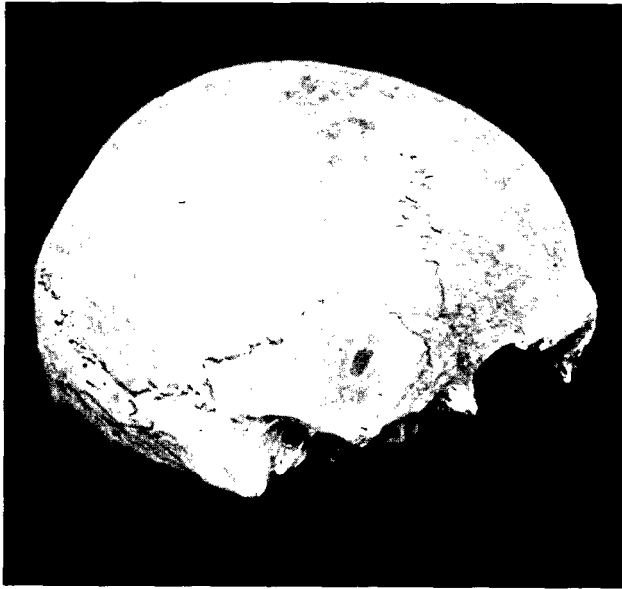
Fig. 3. Norma lateralis of Skull from Short Cist at Carnach, Nairn.

The temporal squamæ are low—distinctly lower than in modern skulls—