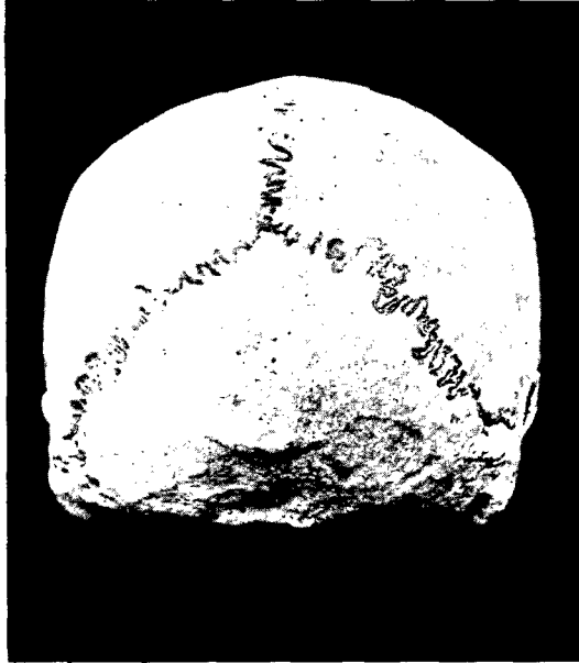
Fig. 5. Norma occipitalis of Skull from Short Cist at Carnach, Nairn.

The long and other bones of the skeleton indicate a male, thirty to thirty-five years of age, of moderate stature—5 feet 5 inches—and of