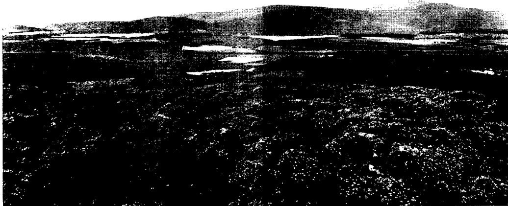
Fig. 2. The Howe of Cromar, looking west from Mulloch.

march the Regent and gain the Capel Mounth pass in safety. Mediæval etiquette, however, demanded a battle under such conditions, and there is no hint that Atholl wished to shirk the issue. His army at the siege of Kildrummy, according to Wyntoun, had numbered three thousand—though the figure is given with reserve: “men said.” As to