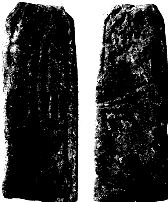
Fig. 2. Fragment of Cross from Monifieth.

other figure subjects, including that of a harper, and elaborate inter-laced designs carved on it. The other three are cross-slabs bearing a