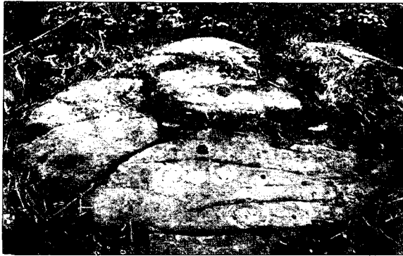
Fig. 4. View of Cup- and Ring-marked Rock at Drummoral, Wigtownshire, from the north.

1. Drummoral, Isle of Whithorn. —For some time I have been interested in the distribution of the cup-and-ring culture in Wigtownshire—especially in the Machars. When the Inventory of Monuments and Constructions in Wigtownshire was published, such rock sculptures were known at ten different places. These were all within a “corridor,” about six miles broad, running north-east across the peninsula from Luce Bay to Wigtown Bay. The northern line of this strip of land ran from Portwilliam in the west to Balfern in the east; and the southern line