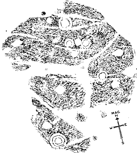
Fig. 5. Rubbing of Cup- and Ring-marked Rock at Drummoral.

On the highest point of the rock, in the angle towards the south, is a cup with two rings. The diameter over all is 5\frac{1}{2} inches; that of the