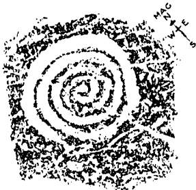
Fig. 7. Rubbing of Spiral cut on Rock at Knock, Glasserton.

and 7). It is to be found on Knock Farm, not far from the village of Monreith, on the road leading down to the ruins of Kirkmaiden Church.