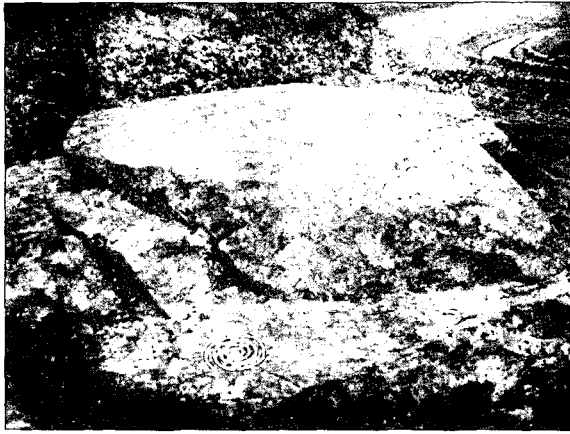
Fig. 6. View of Spiral cut on Rock at Knock, Glasserton, from the south-west.

A few weeks after the discovery of this rock sculpture, a friend handed me a small fragment of stone that he had picked up on the "Duck's Back" green on the Whithorn golf-course. It was only 1\frac{1}{2} inch long, and 1\frac{3}{8} inch broad, by \frac{1}{2} inch thick. It showed plainly two rings and possibly a third. How it had come there he could not say. Possibly the horse-mower had chipped it off an outcropping rock and deposited it some distance away. I have not had an opportunity as yet of making any search.