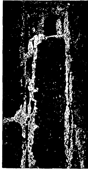
Fig. 1. Front of Cross-slab "A" at Boghouse, Mochrum, before removal.

On being exposed the stones were found to be even more interesting than anticipated. Stone "A," as it lay in the end wall of the byre, had exposed a face with two incised crosses (fig. 1). The cross-slab was of whinstone, 3 feet 2 inches long, by 8 inches wide at its broadest part, by 5 inches thick. It had been cut about by the masons to give it a firmer seat in the byre wall, but happily not to such an extent as to injure the crosses or obscure the