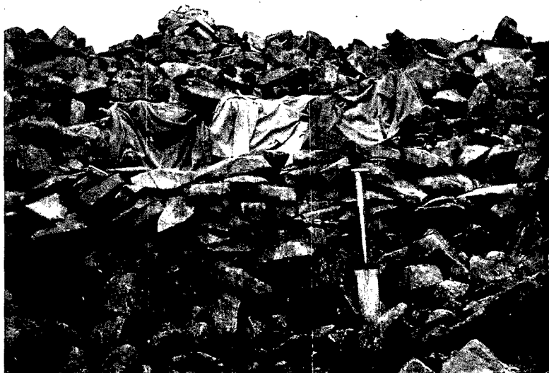
Fig. 3. Long Cairn—"The Mutiny Stones": Part of Wall running across the Cairn.

The ground beneath the cairn was turned over in this area until the reddish-yellow subsoil was reached, but no trace of charcoal, bones, flint, pottery, or other relics was found.