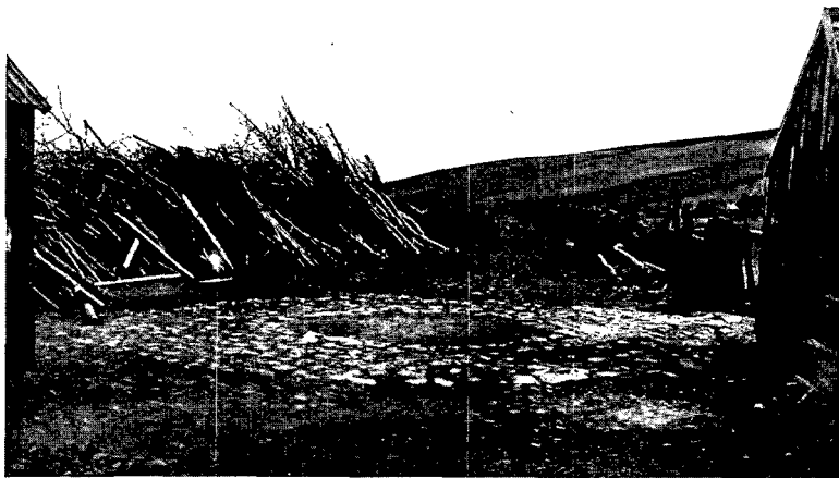
Fig. 1. Course for Roller type of Whin-mill at Blairbowie, Chapel of Garioch.

ground. The larger end was fitted with an arrangement to which a horse or an ox could be harnessed to supply the motive power for rotating the mill-stone. The circular area over which the roller travelled was called the "course," and was paved with flat stones. Upon these the whins were placed, and the horse or ox, yoked to the outer end of the roller, was driven round and round the course for an hour or more until the whin shoots were sufficiently crushed. To assist in reducing them to a pulp, they were now and again sprinkled with water by the man in charge of the operations. By this method a large quantity of whin fodder could be prepared daily, without an undue