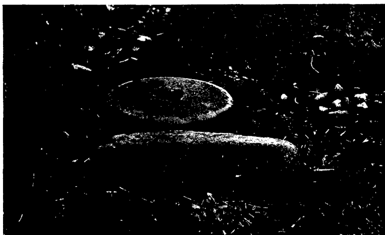
Fig. 4. Grindstone type of Crusher of Whin-mill, and Central Stone, at Burrels, Premnay.

Broomend, Kintore, has a mill-stone of reddish granite, 4 feet 3 inches in diameter and 13 inches thick, the hole for the passage of the shaft through its centre being 8 inches square. This stone was