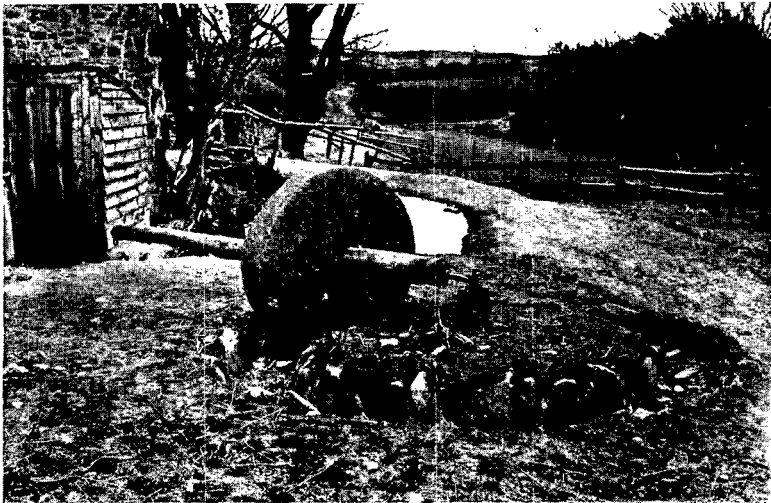
Fig. 3. Whin-mill in working order at Skatebrae, Auchterless.

Burrels, Premnay. —This farm is also known as West Side of Premnay. It contains the remains of a whin-mill of peculiar construction, inasmuch as it possessed two circular stones, a large and a small one, and it is