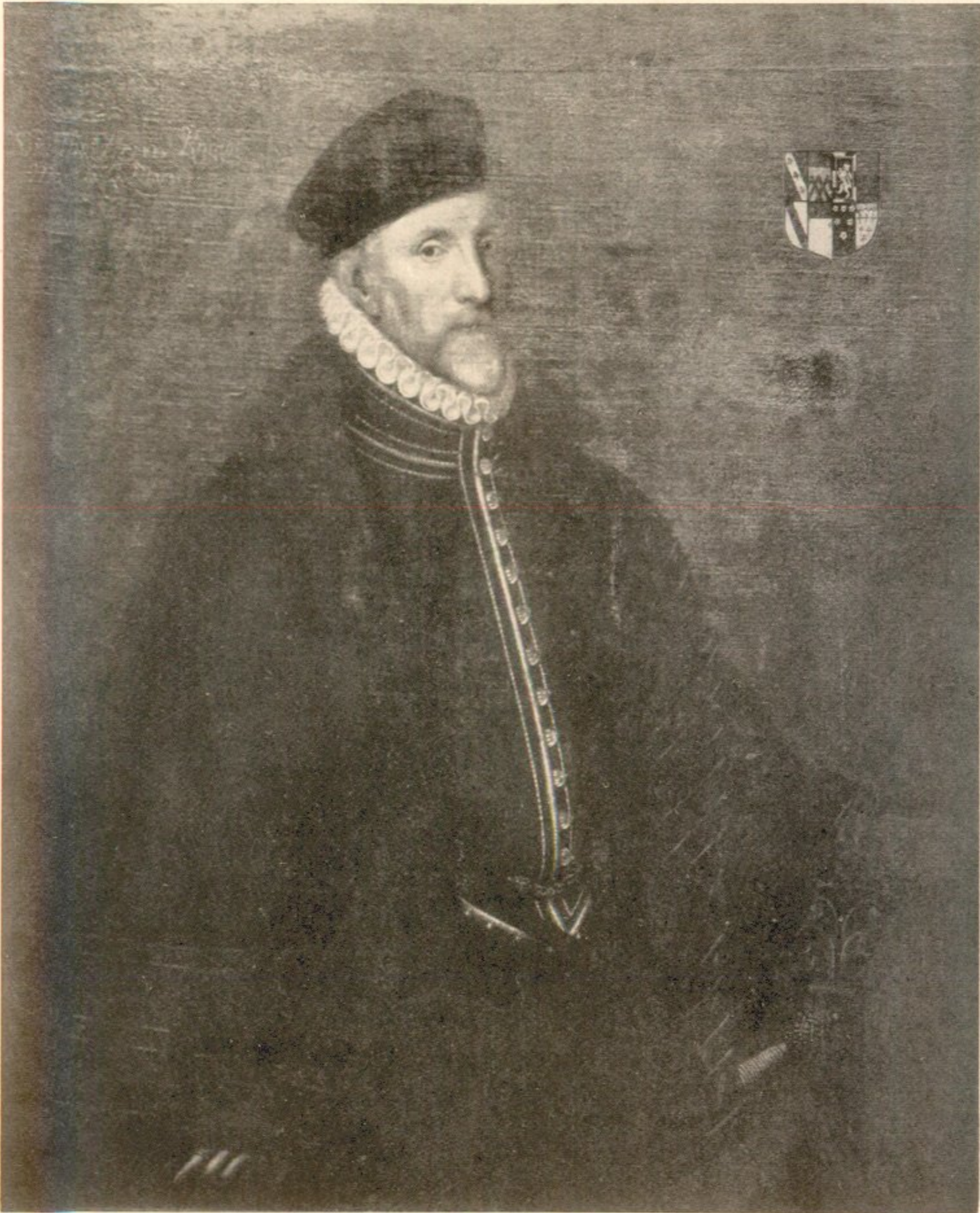
Fig. 1. Portrait of Sir Thomas Hervey at Abbotsford.