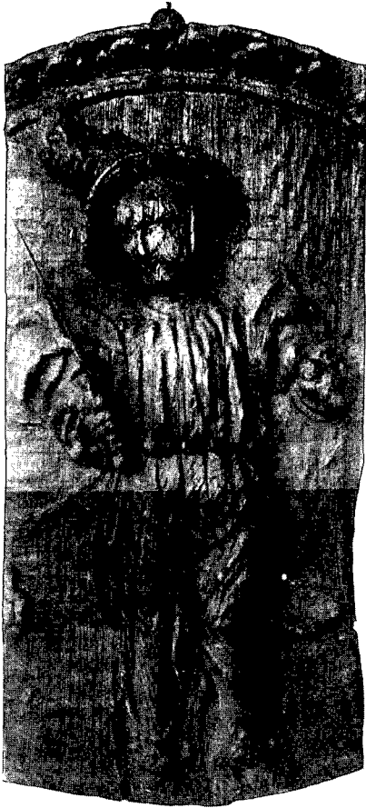
Fig. 1. Wooden Panel from Stirling Castle.