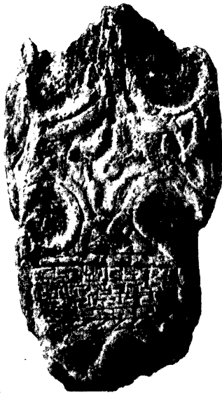
Fig. 2. Cross-slab from Elrig.

Immediately beneath the head, separated by a band \frac{1}{2} inch in breadth, is a sunk panel containing an exceedingly simple form of ornament in high relief. From the fragment remaining it is difficult to say definitely whether the design is of a single strand interlacing, or of a grouping of four loops or sub-ovals, each about 4\frac{1}{2} inches long by 2 inches broad, so inclined to each other as to fill the breadth of the panel, and meeting centrally. The latter seems more probable, as there is no sign of any attempt to give the effect of one line passing over another. Between the angles formed by the inclined loops, a pellet 1 inch in diameter is inserted. The motif would possibly be repeated downwards on the shaft.