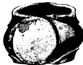
Fig. 2. Bronze Finger-ring from Muirkirk. (3.)

Massive late-Celtic Finger-ring of Bronze, 1½ inches and 1⅜ inch diameter (fig. 2), found under a stone near the edge of Wardlaw Cairn, Muirkirk, Ayrshire.