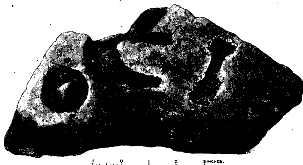
Fig. 1. Sandstone Mould from Dunsapie.

Mould of red sandstone (fig. 1), imperfect, HA inches by 6 inches by