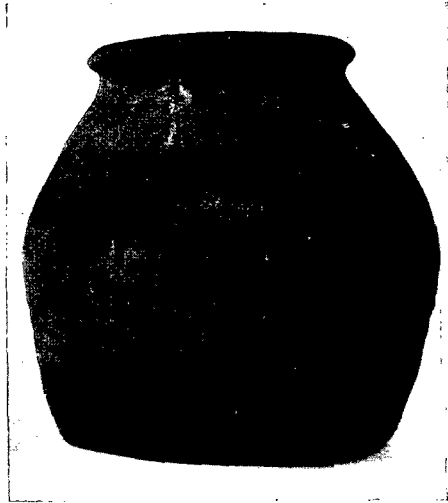
Fig. 5. Cooking-pot from Kidsneuk, Ayrshire. (Height, 5 inches.)

In addition to the two perforated mediæval pots, mention may be made of a small jug of dirty-white earthenware preserved in the Museum which also has holes bored in the wall (fig. 6). It was found filled with coins of Alexander III. and Edward I. and II. at Eastfield, Penicuik, Midlothian, in 1792. 3 It measures 4 inches in height, 3 inches across the mouth, 2\frac{5}{16} inches at the neck, 4\frac{3}{16} inches at the shoulder, and 3\frac{3}{8} inches at the base which, like the pots described, is slightly convex on the outside. Owing to this convexity, when placed upright the jug stands tilted to one side. The handle is broad in relation to