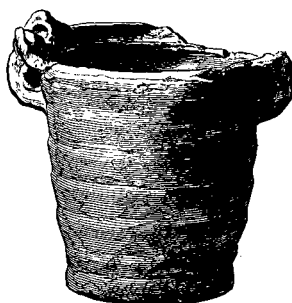
Fig. 3. Urn found in a Cairn at Memsie, near Rattray, Aberdeenshire.

during historical times in different countries in Western Europe, that in France very many pots of clay have been found in graves dating from the twelfth century to the seventeenth century, and that the custom was not unknown in Scotland. A small pot (fig. 2), 5 inches in height, with concave sides ribbed horizontally, the base wider than the mouth, and pierced with three holes in the side and one in the base, was found with two others under a flat slab at the Castlehill, Rattray, Aberdeenshire, in 1829. 3 A flower-pot shaped vessel (fig. 3), ribbed horizontally, 4½ inches in height, with two pierced ears at the lip, a ledge for a lid, and the interior glazed, was found with part of an iron sword in a tumulus at Memsie, Aberdeenshire, in 1827. 3 Both these pots are now in the National Collection, and the other two from Rattray are in the Museum at Marischal College, Aberdeen University. In 1834 four small vessels of red earthenware, bearing a strong resemblance to the Dunbar pot, but pierced with a number of holes at the shoulder, were found in a stone