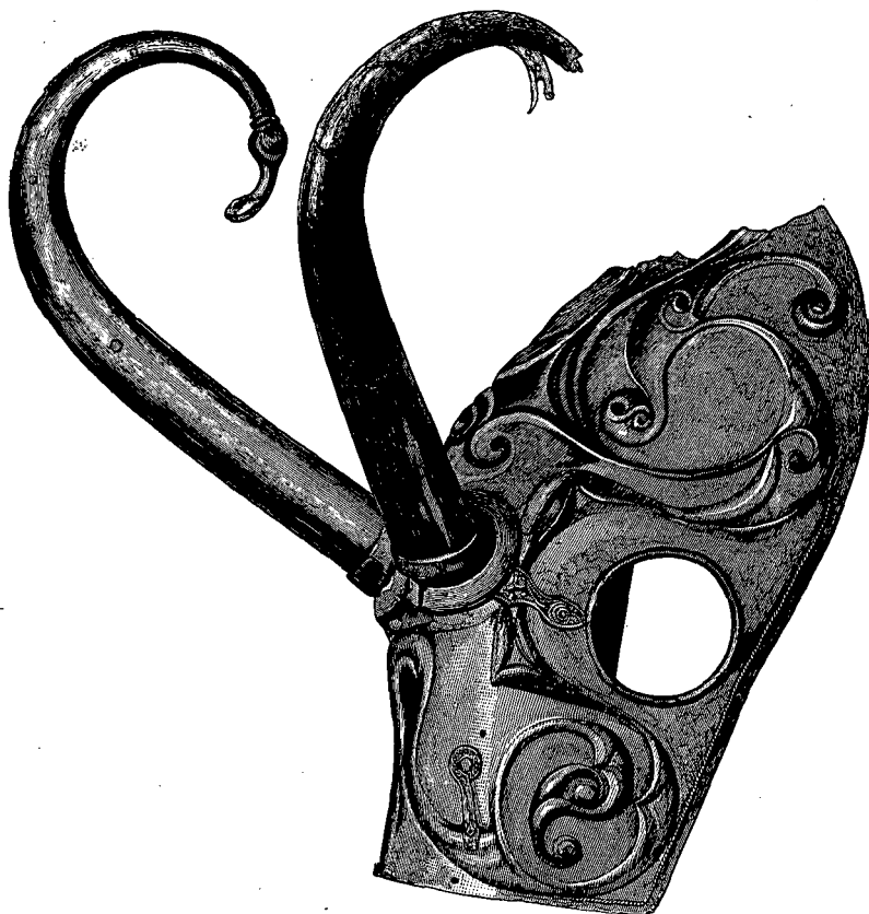
Fig. 2. Bronze Mask with Horns, found at Torrs, Kirkcudbrightshire. (10½ inches in greatest length.)

Eight Communion Tokens, and three Medals commemorating the death of the Duke of York, 1827, the Coronation of Queen Victoria, and the Burns Festival, 1844.