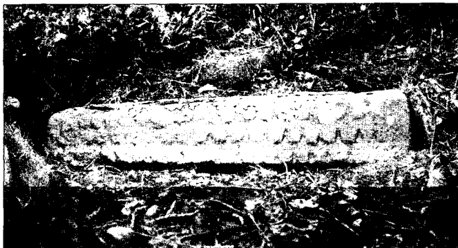
Fig. 1. Coped Stone at Papa Westray, Orkney.

At the east side of the church in the graveyard there is a coped stone of not uncommon type (fig. 1). It measures 5 feet 1 inch in length, and has a base about 14 inches in width at one end, and 16½ inches at the other; the height at the ends is 8 inches and 10 inches respectively. The sloping sides, which taper from 12 inches to 10 inches on either side, are covered with three rows of well-defined tiles, or shield-shaped scale-