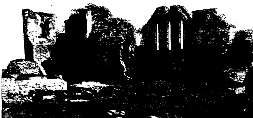
Fig. 3. Kildrummy Castle: East Front from courtyard.

the best preserved is the north-eastern or Warden's Tower, 37 feet in diameter, and still over 50 feet high. It has beautiful two-light pointed windows and large mural chambers (fig. 2). On the north side is a postern, with a portcullis slot and remains of a sunk passage, leading down Back Den. In the court are: the hall against the north curtain, measuring 71 feet 5 inches by 39 feet; the chapel on the east, 49 feet 7 inches by 18 feet, with its beautiful three-light window—an austere specimen of