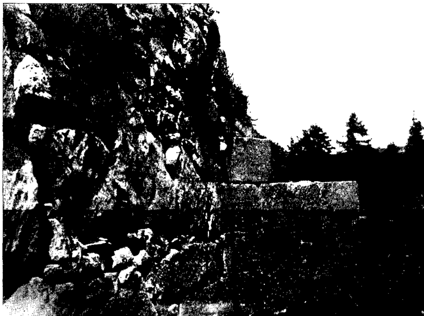
Fig. 5. Kildrummy Castle: interior view of junction between Snow Tower and rebuilt west curtain.

English under Prince Edward, the Queen fled north, while Nigel remained to hold the castle. The ensuing siege, Nigel's heroic resistance, the burning of the castle by the blacksmith Osborne, and the tragic fate of the garrison are told with splendid vigour in Barbour's Brus . The castle fell before 13th September 1306, and the English, having breached the Snow Tower, abandoned the ruins. Donald, Earl of Mar, who had