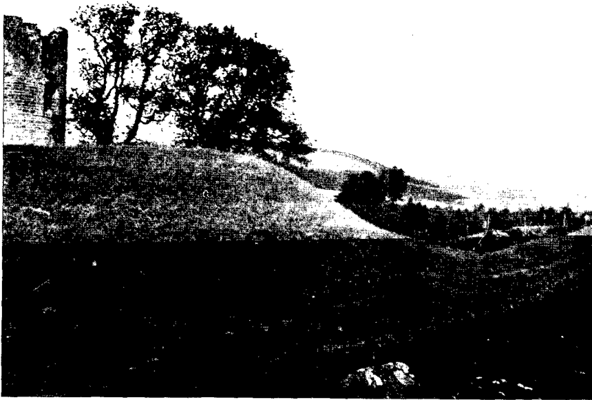
Fig. 6. Kildrummy Castle: north end of Ditch and Warden's Tower.

about the entrance were obtained several fragments of pottery and rusted iron; two great iron nails (found in the barhole of the sally-port); and a few bits of ancient glass. Several of the massive roofing slabs, composed of hard schist \frac{1}{2} inch thick, with great round holes for wooden pins, were also unearthed. Considerable quantities of bones were obtained, mainly of the ox and horse; a complete skeleton of the latter