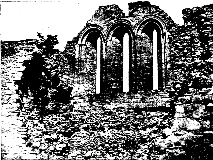
Fig. 4. Kildrummy Castle: interior of Chapel Window.

cubical blocks with very wide joints in the Snow Tower, the masonry of which has a most strikingly Norman appearance, and in a church would be assigned without hesitation to the twelfth century. The outer walls are 9 feet thick, except in the donjon, where they attain a thickness of 13 feet 4 inches. Outside the west wall was the castle garden, and the burn in Back Den was dammed to form a fish pond and "plesauunce." Several farms in the vicinity, such as Gardener's