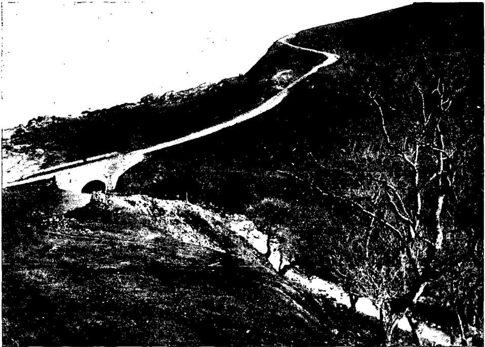
Fig. 2. Cairn from the north-west.