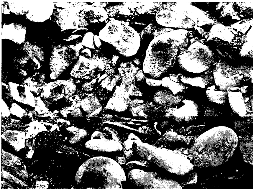
Fig. 11. Inhumed Burial (D in sectional drawing) among loose stones.

Skeleton D. —After the turf and mass of stones had been cleared away