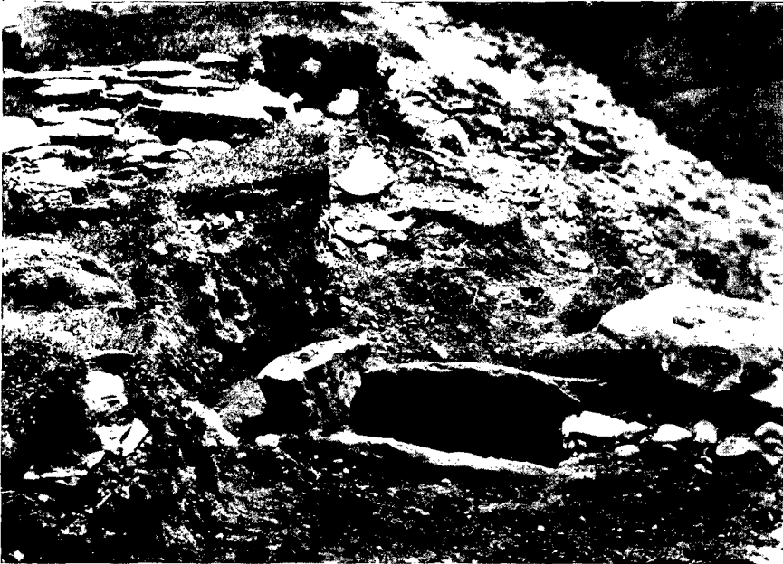
Fig. 5. Cist No. 1 at extreme south end of cairn ; Cover-stone to right.

On removing the sand carefully from the interior there was met with at a depth of 12 inches a thin horizontal layer of fine gravel, on which was a great quantity of small fragments of burnt bones. In the south-most corner of the floor was a shallow heap, about 12 inches diameter, of very black soil with much charred wood. Outside the cist, and at