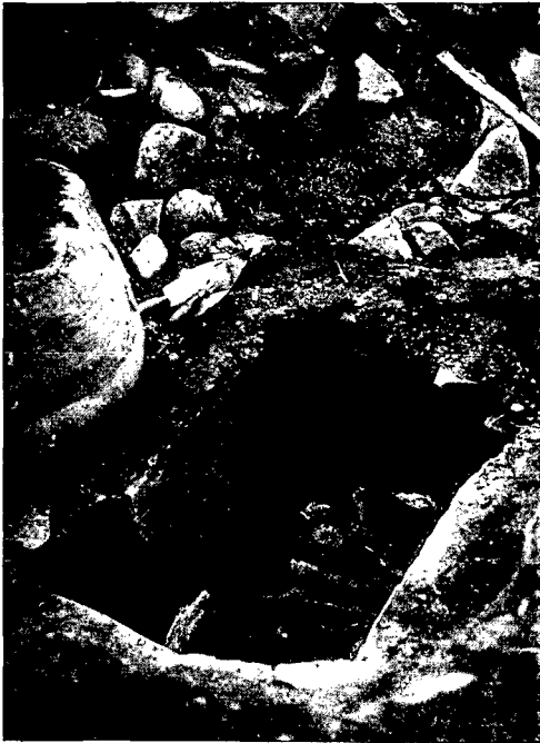
Fig. 9. Cist No. 9, looking into its north corner.

Cist No. 9. —This chamber lay with its longer axis almost parallel to those of Cists 2, 5, and 12, and exactly parallel to that of Cist No. 10. It also lay parallel to the row of irregularly laid stones to the north-west, and to the axis of the large recumbent slab—the largest stone in the whole cairn—which lay to the west. The cist measured inside 34 inches by 20 inches and was 22 inches deep. It was covered by an irregular, oval, flattish stone 54 inches by 36 inches, and 12 inches thick (fig. 9).