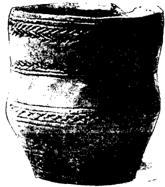
Fig. 8. Beaker Urn from Cist No. 6.

On sifting the sand which filled the vessel a discoid bead of fine dense, hard, well-preserved, very black lignite was found. Another larger bead of the same shape, material, and quality was got close to the outside of the mouth of the vessel. Both beads are of the same type, and are \frac{1}{30} inch thick, centrally perforated, the opening in either case having vertical walls. They are perfectly made discs with vertical sides (fig. 7).