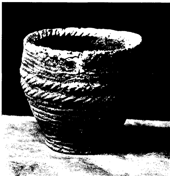
Fig. 10. Food-vessel Urn from Cist No. 9.

As "food-vessels" have been most frequently found associated with inhumed burials, it would seem that the pottery and flints uninjured by