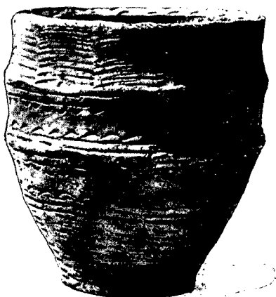
Fig. 6. Food-vessel Urn from Cist No. 4.

Precisely at right angles to, and therefore lying north and south of, the passage, and nearly connecting it with Cist No. 2, was the row of six stones already described. To the north of this cist, No. 3, touching its east side and running out north-east, was a vertical slab 4 feet long, and set at right angles to it, at the east extremity of the slab, was another one about 3 feet long. These two slabs looked as if they had once formed two sides of a rectangular cist from which the other couple of slabs had been removed.