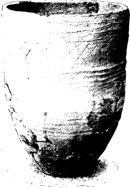
Fig. 4. Cinerary Vessel from Cist No. 5.

As destruction was slowly overtaking it, it was considered advisable to get the remaining portion of the cairn thoroughly explored. His Grace the late Duke of Argyll, K.G., K.T., LL.D., F.S.A. Scot., proprietor of that part of Kintyre, at once granted permission, and assisted in every manner, expressing his desire for an expert scrutiny.