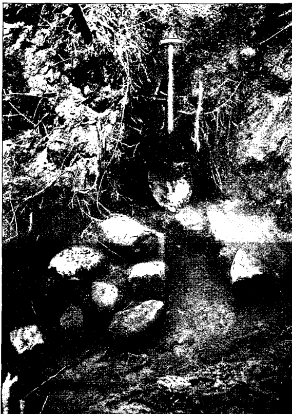
Fig. 4. Construction, possibly a Fireplace, in Mound at Kidsneuk.

flatness. In size they averaged rather under a cubic foot; they were dry-laid and set to face outwards. A channel or flue, also faced, radiated inwards. In the immediate neighbourhood there was abundance of cinder, charcoal, and a little bone. The construction appeared to the excavators to resemble the primitive fireplaces which have not long