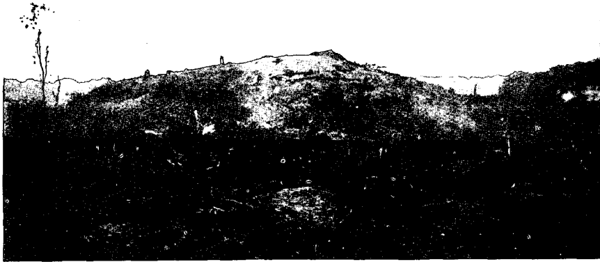
Fig. 1. Mound at Kidsneuk, Bogside.

On 30th April 1917, a trench 2 feet wide was excavated on the west side extending 9 feet outwards from the base of the mound (No. 1 on plan (B) of excavations, fig. 2). The material of which the mound was formed was found to be very fine yellow sand. At 3 feet 6 inches down the colour of the sand changed very sharply to white, the contrast between