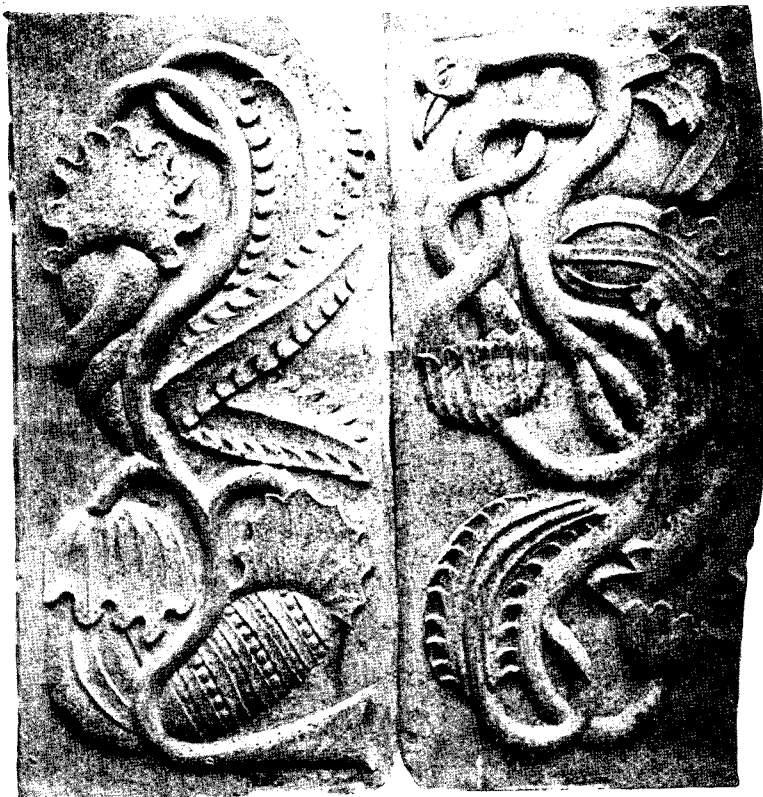
Fig. 4. Carved Oak Panels found in "Cardinal Betoun's Chapel," Ethie House.

any distinct trace of Perpendicular work, unless the two lower panels in the left-hand door (fig. 1) should be so regarded, but I think them more likely to be French in feeling, with a suggestion of the Flamboyant style. The introduction of a foliaceous ornament in some of the spandrils of the upper arches is not to be disregarded. The two upper panels of the right-