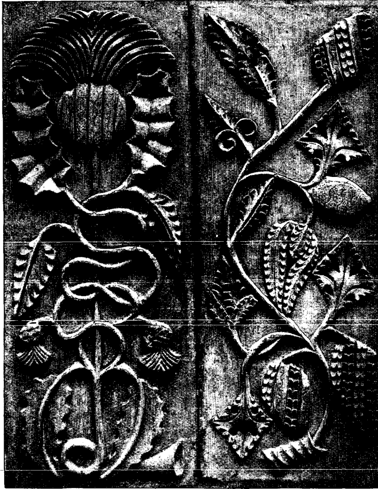
Fig. 3. Carved Oak Panels found in "Cardinal Betoun's Chapel," Ethie House.

Society. I have no doubt they will be regarded with much interest; and, so far as known to me, they have never before been published.