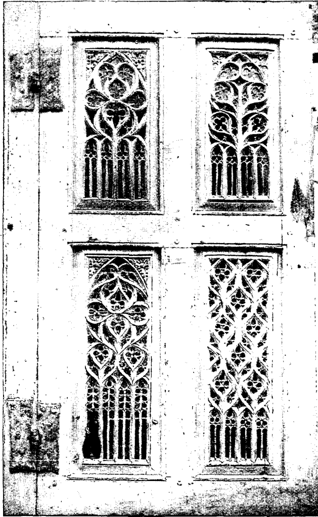
Fig. 1. Left-hand Door of Ethie Cabinet.

fixed as above mentioned in the walls of the "haunted room," it was found that only the front part, consisting of the carved doors, was available, and that a suitable framework would be necessary. With this view