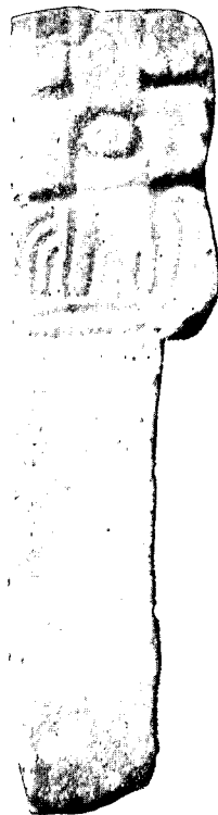
Fig. 2. Slab from Kirkyard Wall.