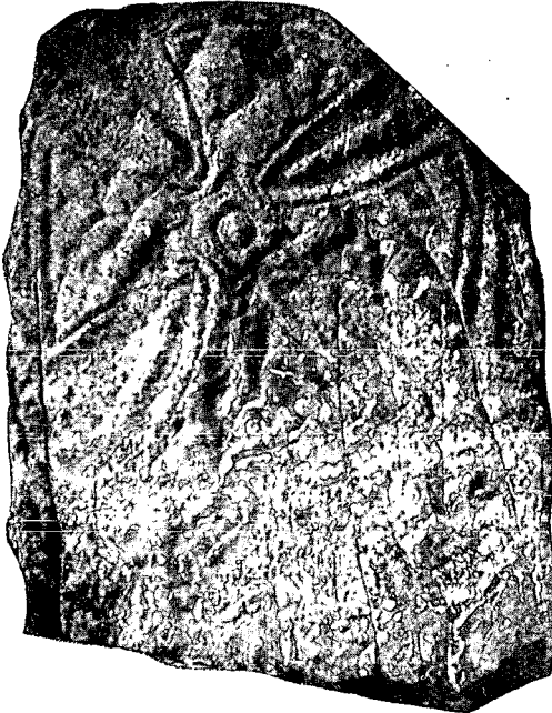
Fig. 3. Slab from Kirkyard Wall.

"These drawings are rude, but we may fairly infer the substantial accuracy of the sketch of the third and lost stone from the accuracy of the sketches of the other two, which we can still compare with the originals, as carefully depicted in figs. 1 and 2 of Plate XXXIX. The only mistake Mr Todd appears to have made is in substituting an R for an M at the end of INITIUM. I assume this to be an error in his drawing."