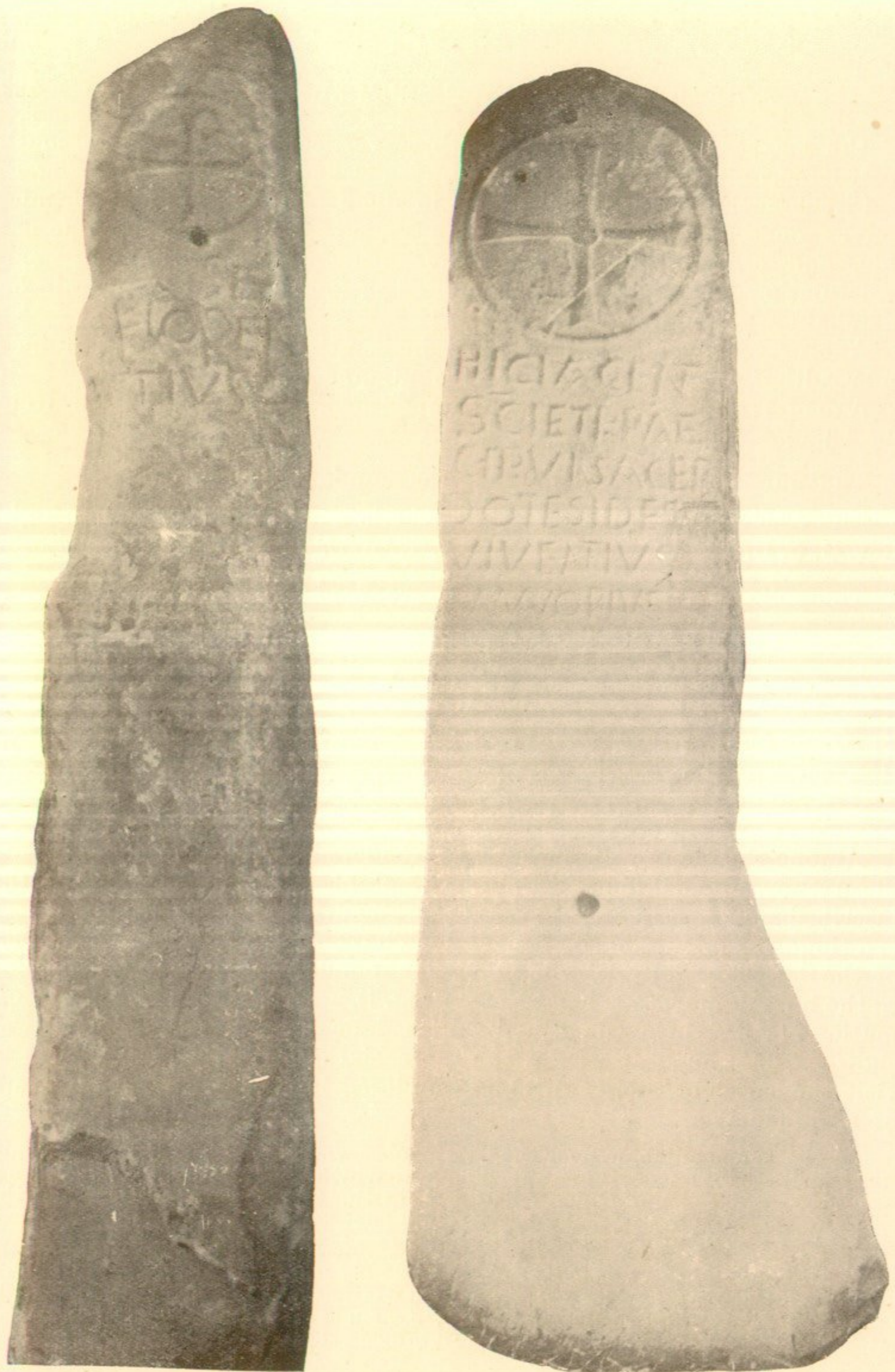
Fig. 1. Pillar Crosses formerly used as Gate Posts in the Kirkyard.