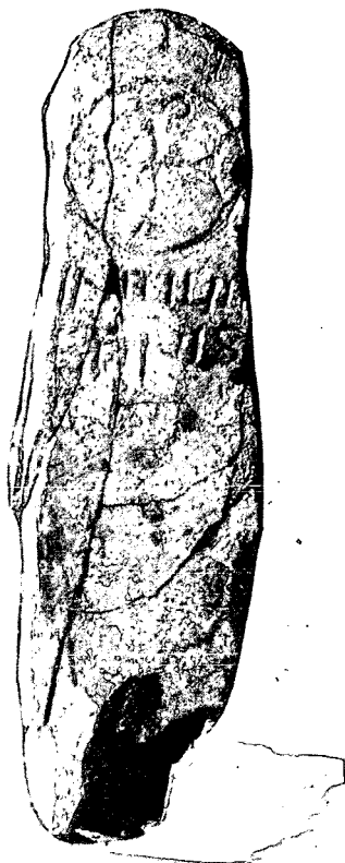
Fig. 5. The missing Sculptured Slab, now recovered.

"The attached drawings and photographs were taken from the stone before the repairs."