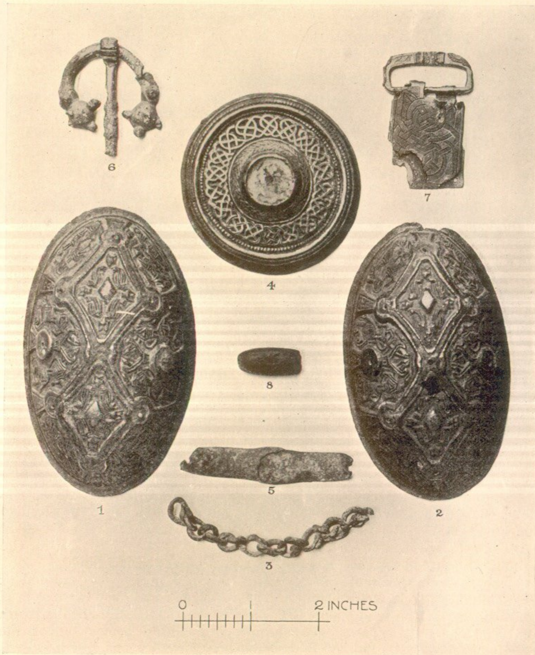
Fig. 1. Ornaments of Viking Time from Valtos, Uig, Island of Lewis.